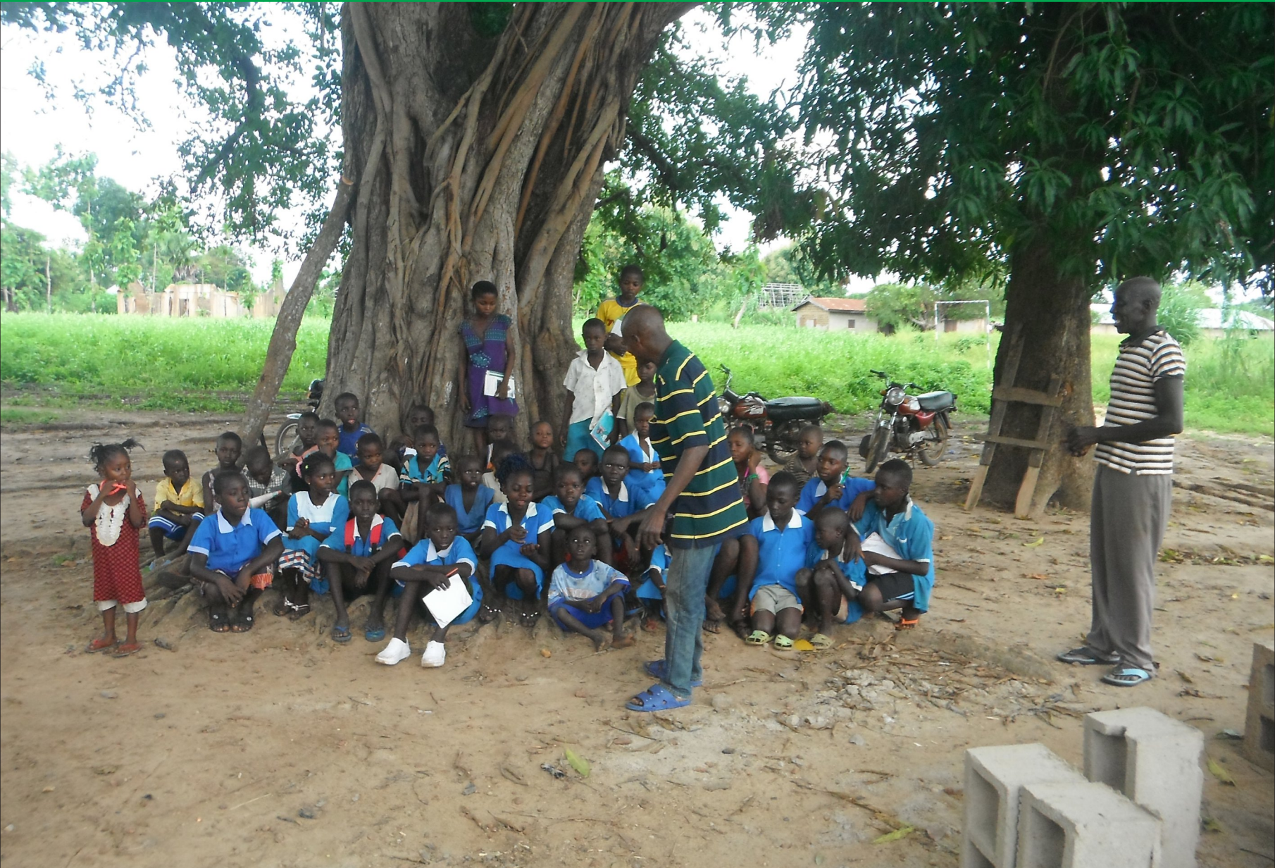
Pupils of Ugboju RCM Primary School in Agatu Local Government Area of Benue State learning under a tree where they experience a lot of distractions.