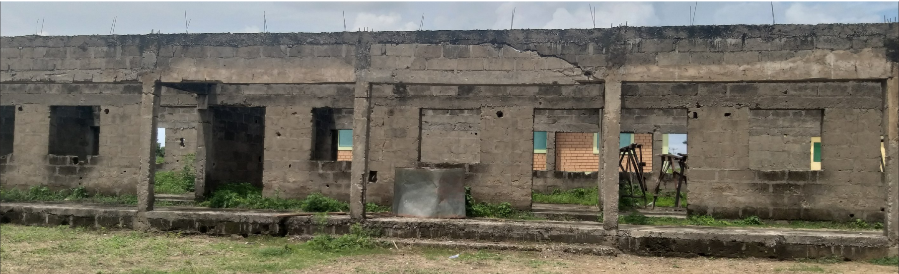
An abandoned project in LEA Primary School, Chibiri, Kuje Area Council, FCT