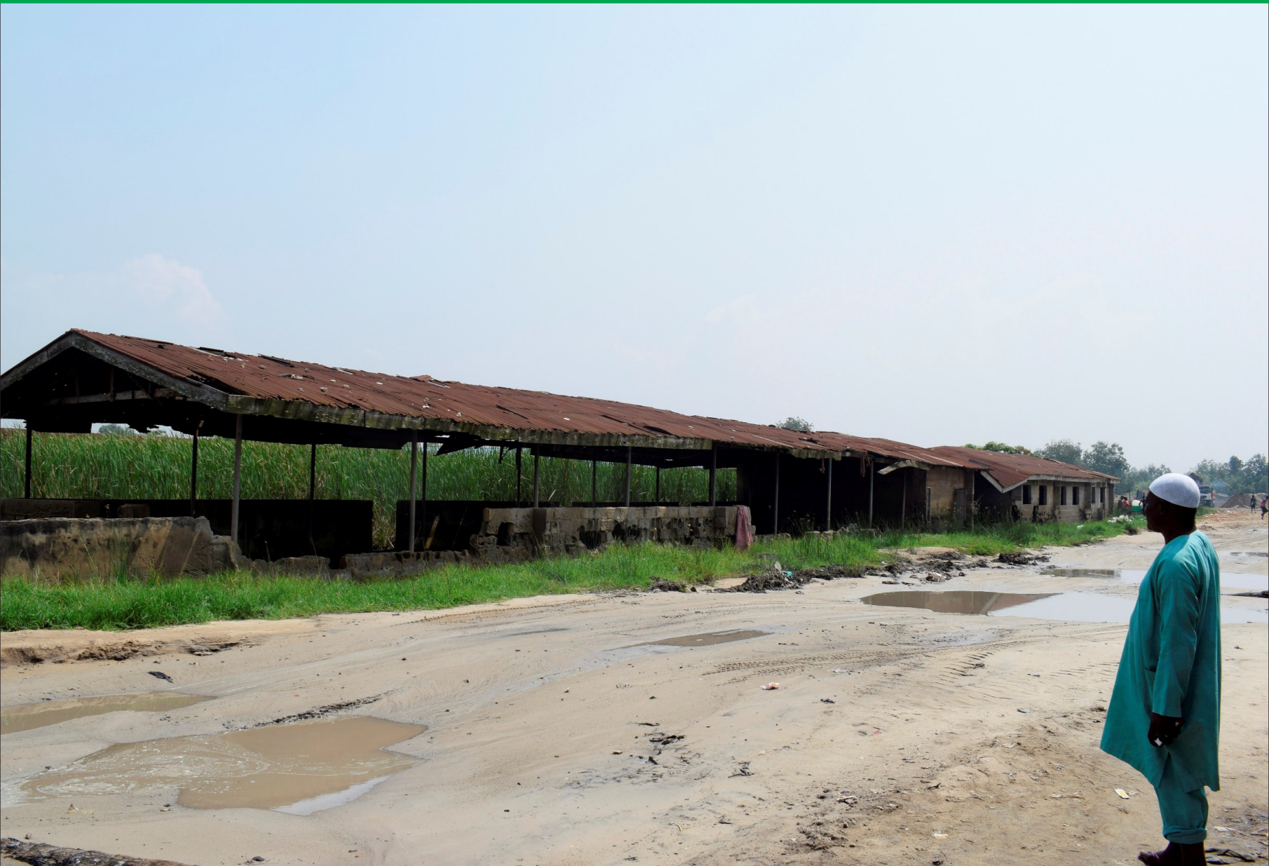
Abandoned Ajegunle Junior and Senior High School, Ikorodu Road in Kosofe Local Government Area of Lagos