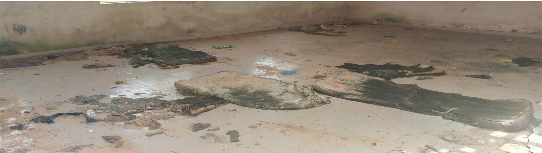
Decayed mattresses at Tsangaya Model Primary School, Tarasa Birnin Kebbi, Kebbi State