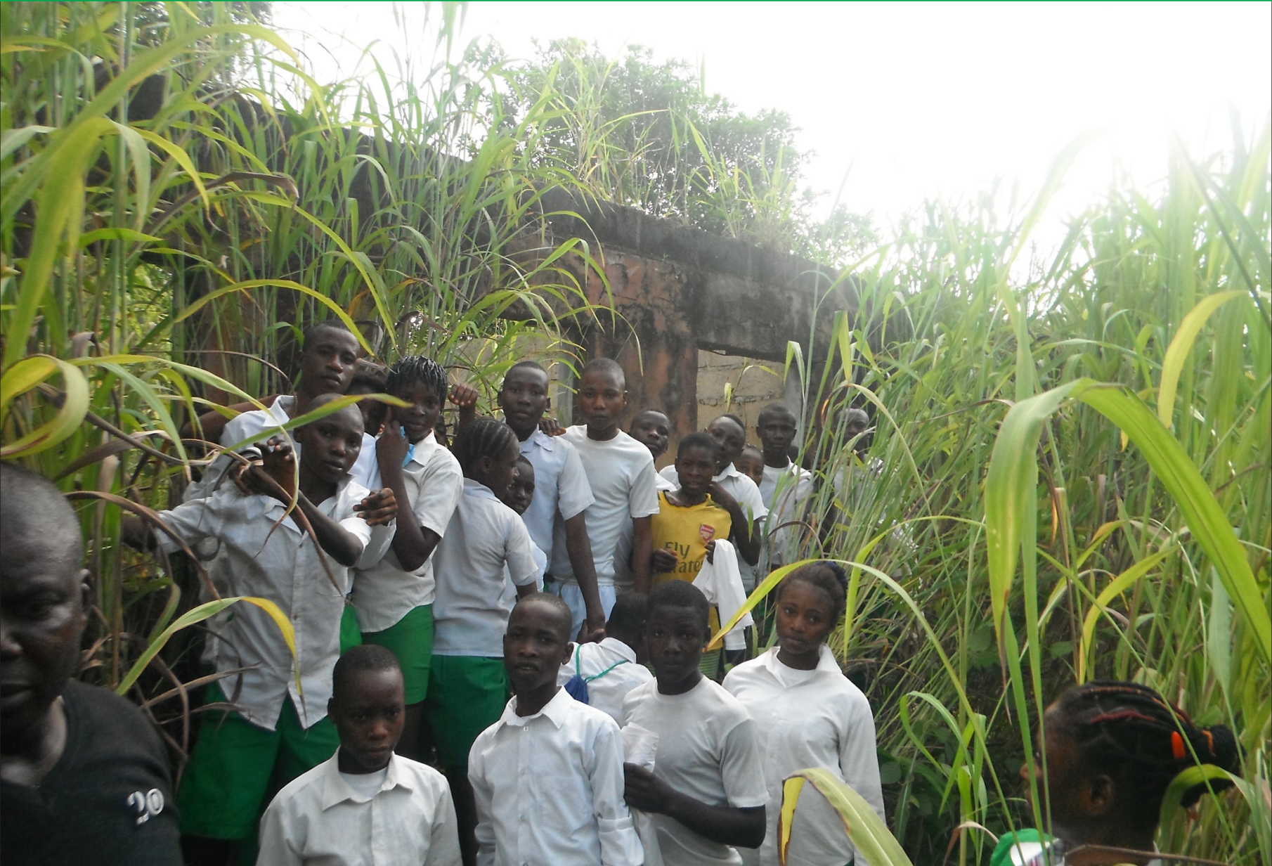
Pupils of Government Junior Secondary School, Okokolo in Agatu Local Government Area of Benue State showing their school building burnt by suspected herdsmen in 2014 and abandoned since then. The entire compound has been overgrown by bush.