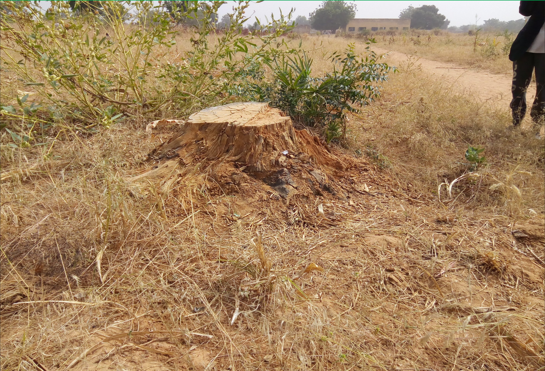
This tree was used to make desks for Gawo JSS 2 students, Gezawa LGA