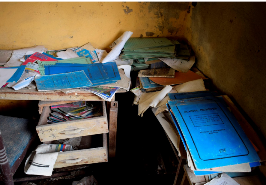
Student records and teachers' classroom notes