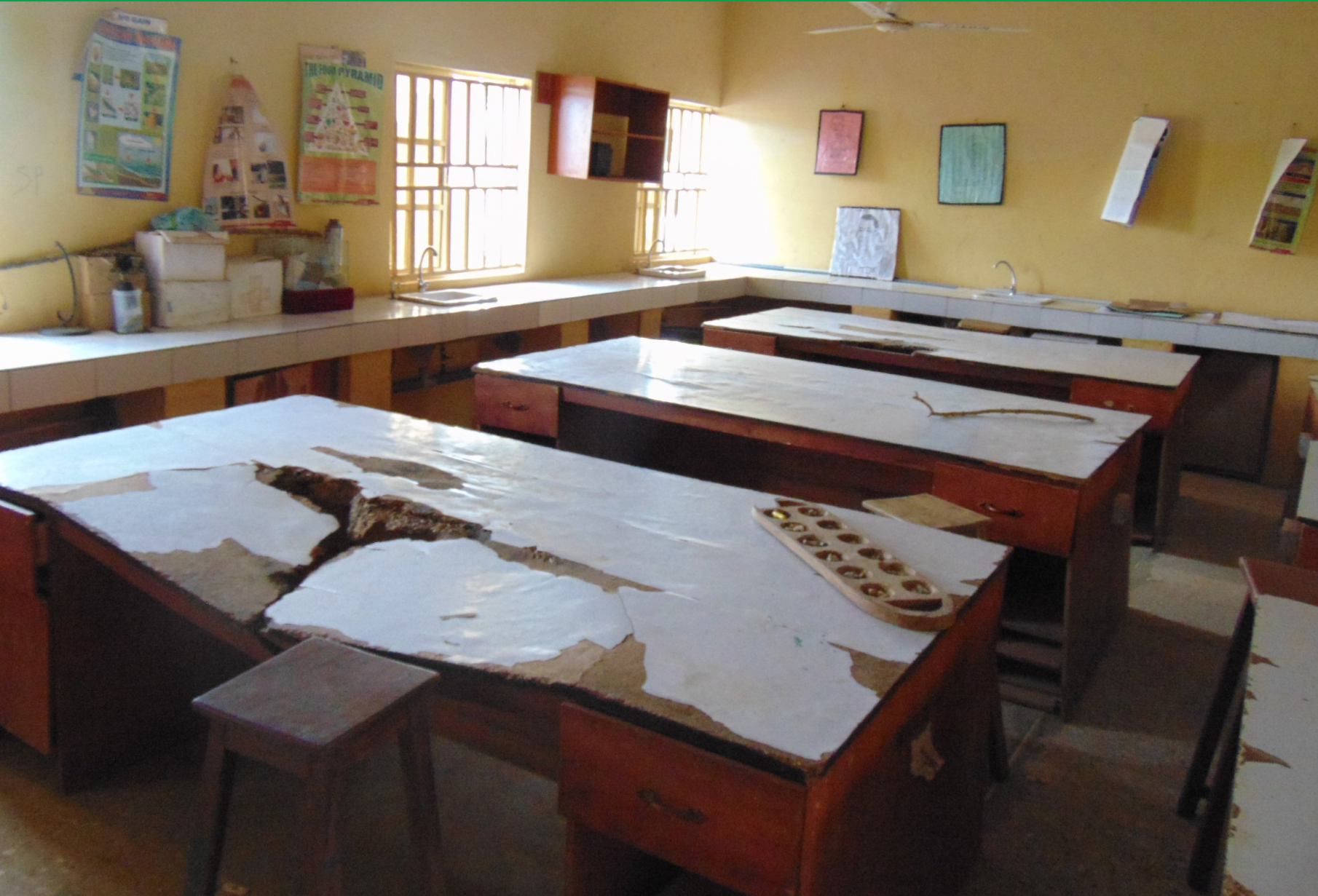
Broken table at the technical workshop at JSS Karshi, FCT, Abuja