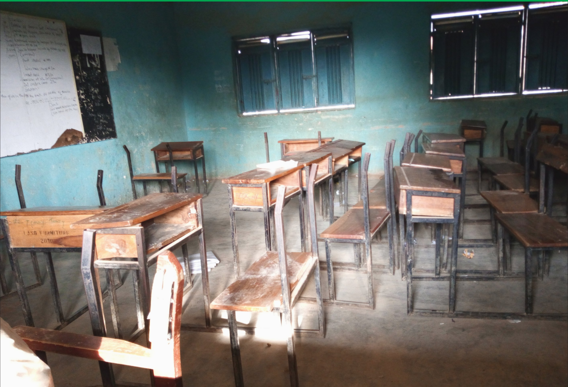
A classroom at Ajumoni Senior Grammar School, Okota area of Isolo, Lagos, in a bad state