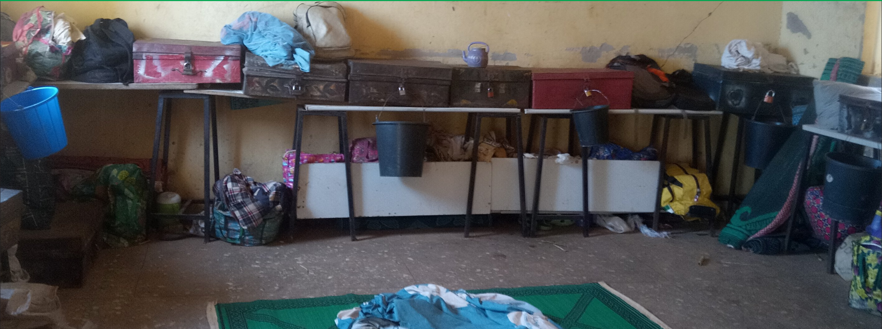
Boarding school bags, buckets and other items belonging to Almajiri pupils of Gwarindjaji Tsangaya Model School, Kebbi State