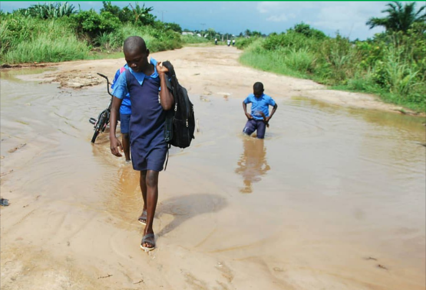
Students of Ikoga Grammar School, Badagry, Lagos wading through the stream to access basic Education