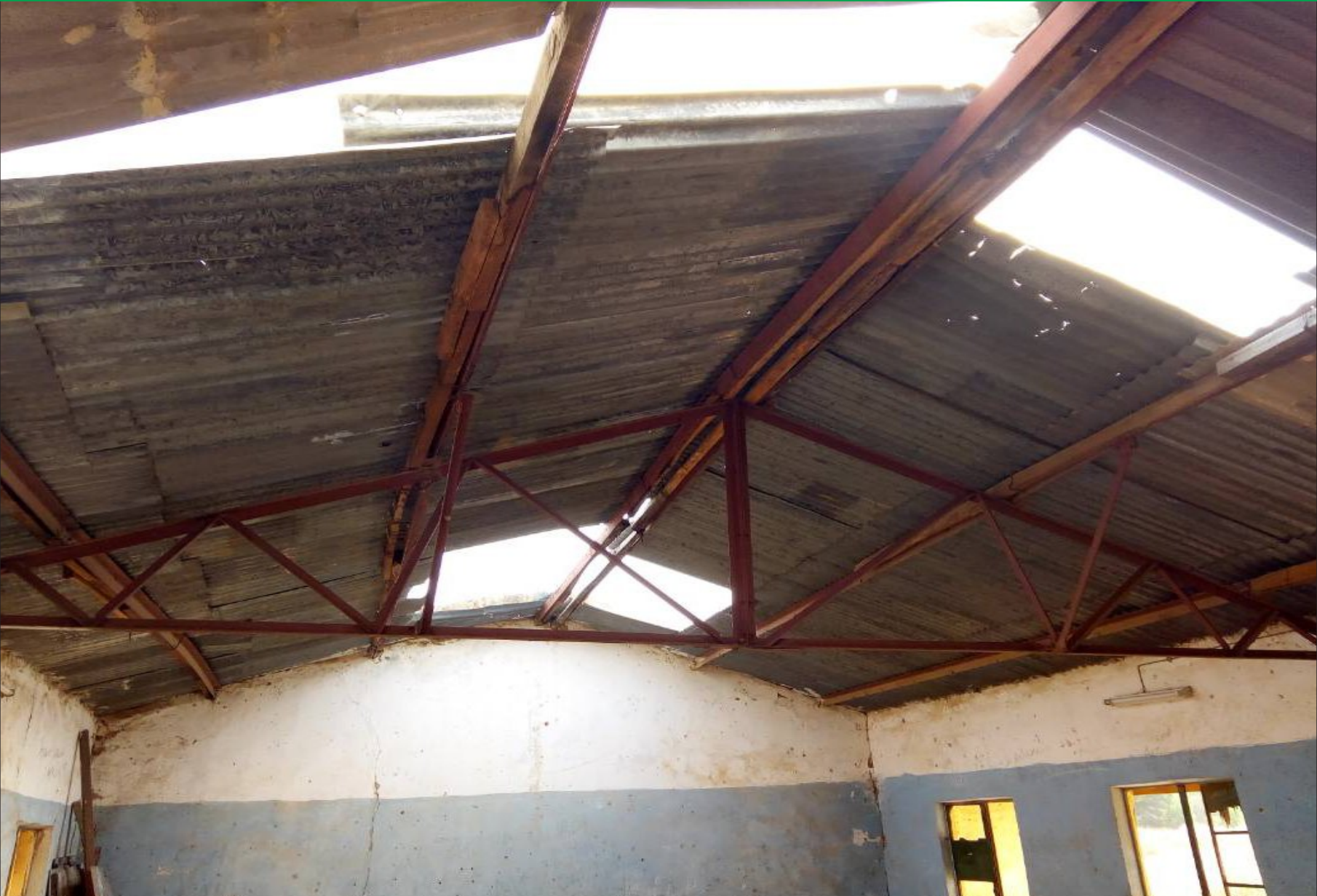
A classroom with damaged roofs at Gandu Model Primary School, Gezawa Local Government Area, Kano State