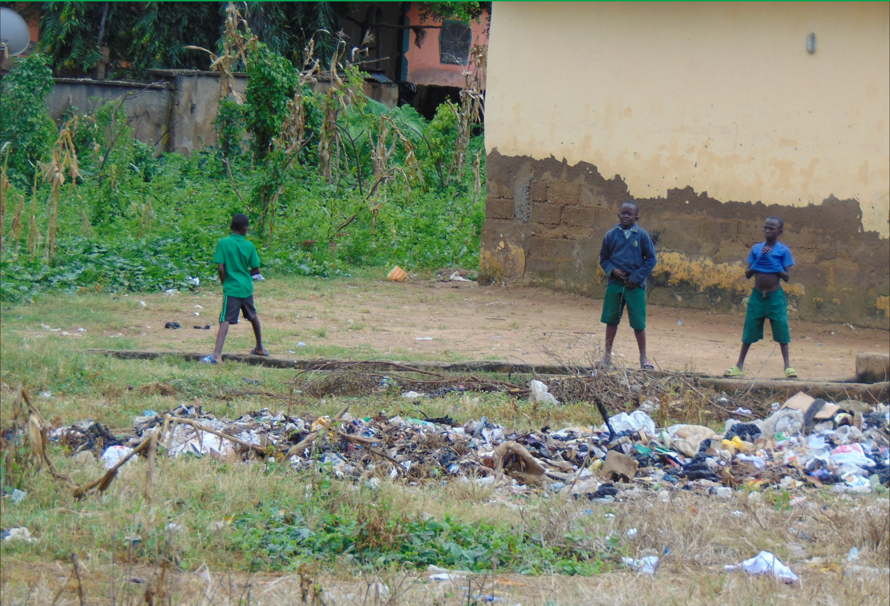
Pupils urinating in the open at LEA Pilot Science Primary School Karshi, FCT, Abuja