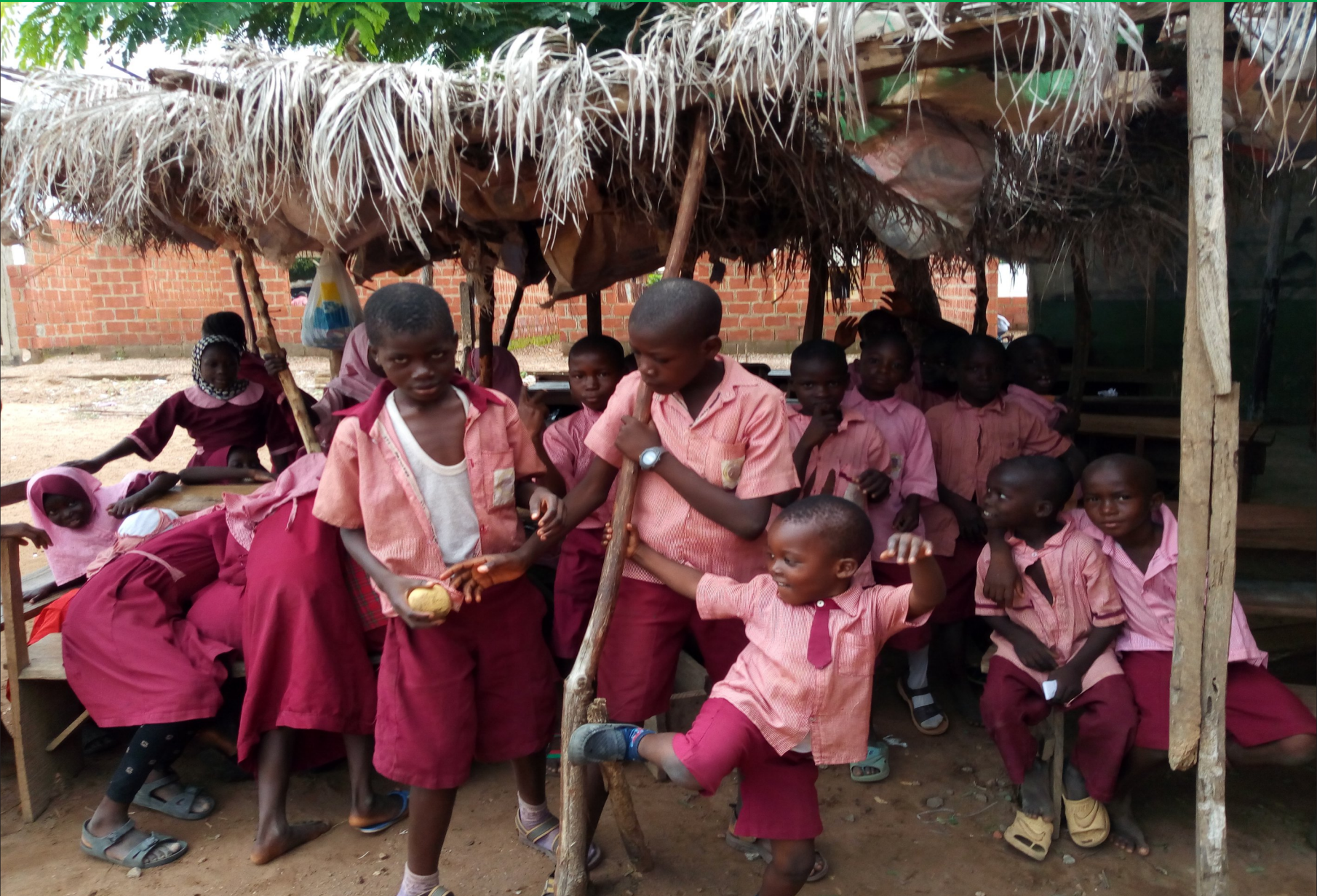
A thatched-roof class at Sobi Alagbado LGEA School, Kwara South Senatorial District, Kwara State