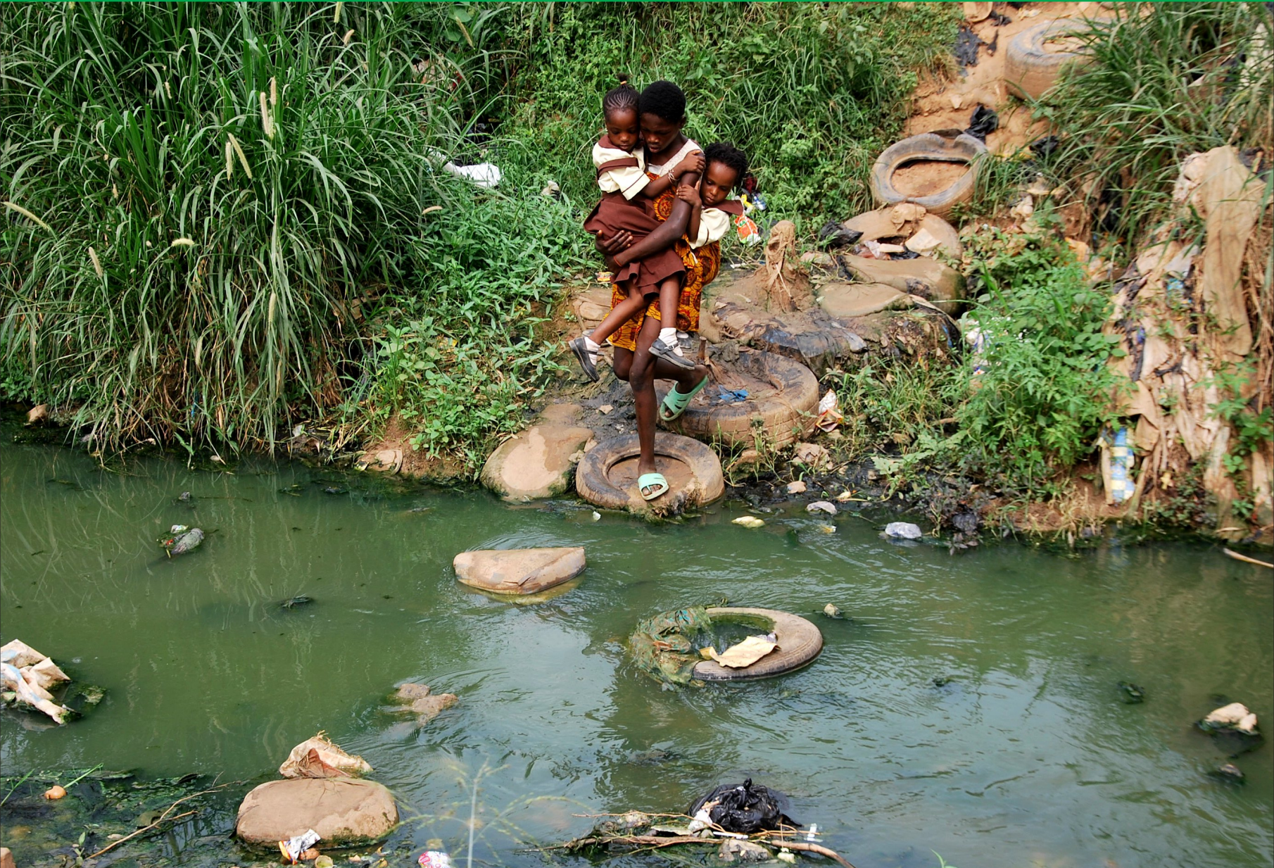
A girl navigating a flood canal with school children at Olajide Street, Aboru in Ogun State, a border community with Lagos State