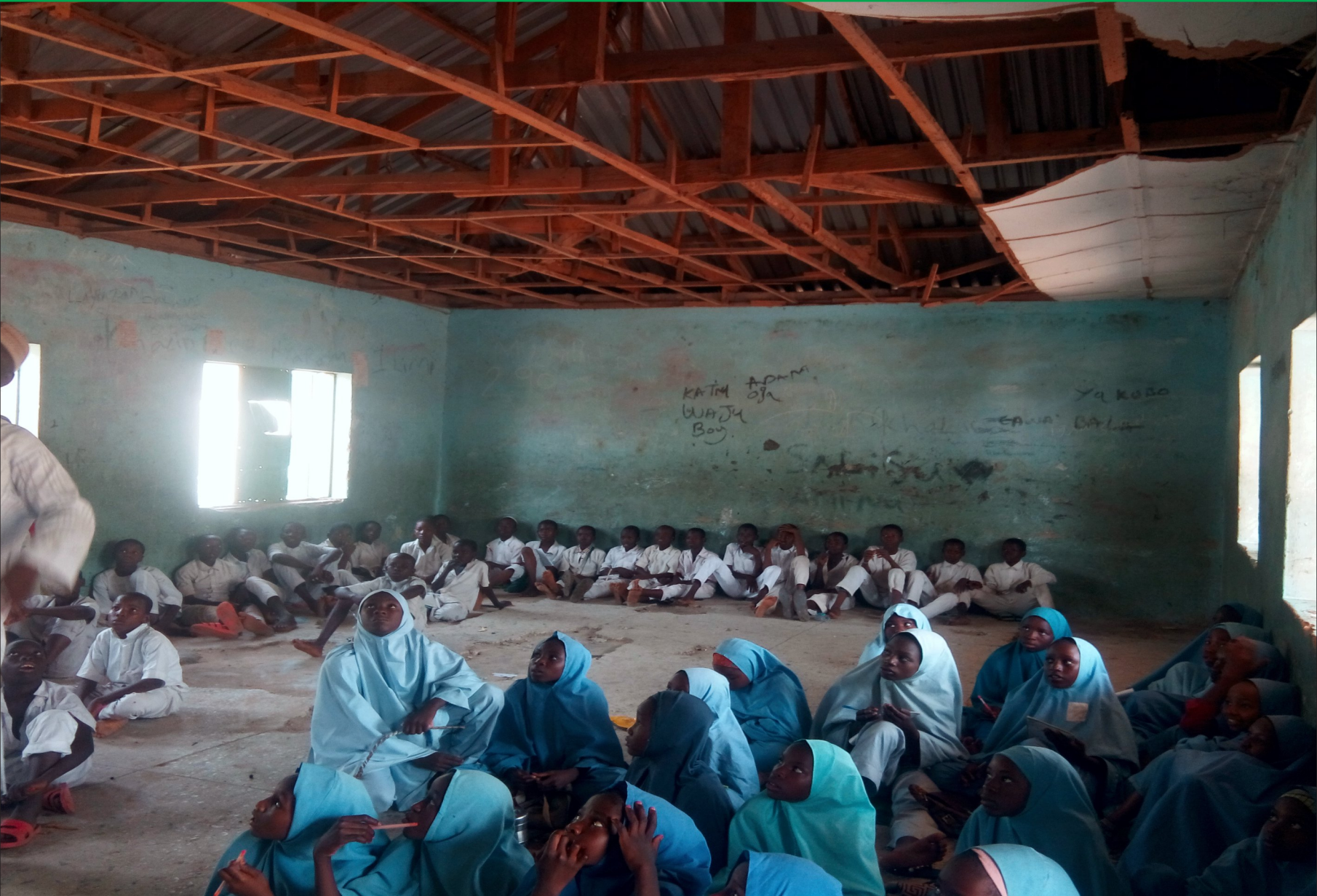
Pupils of primary five sitting on bare floor in a dilapidated class at Baba Sidi Primary School, Bauchi