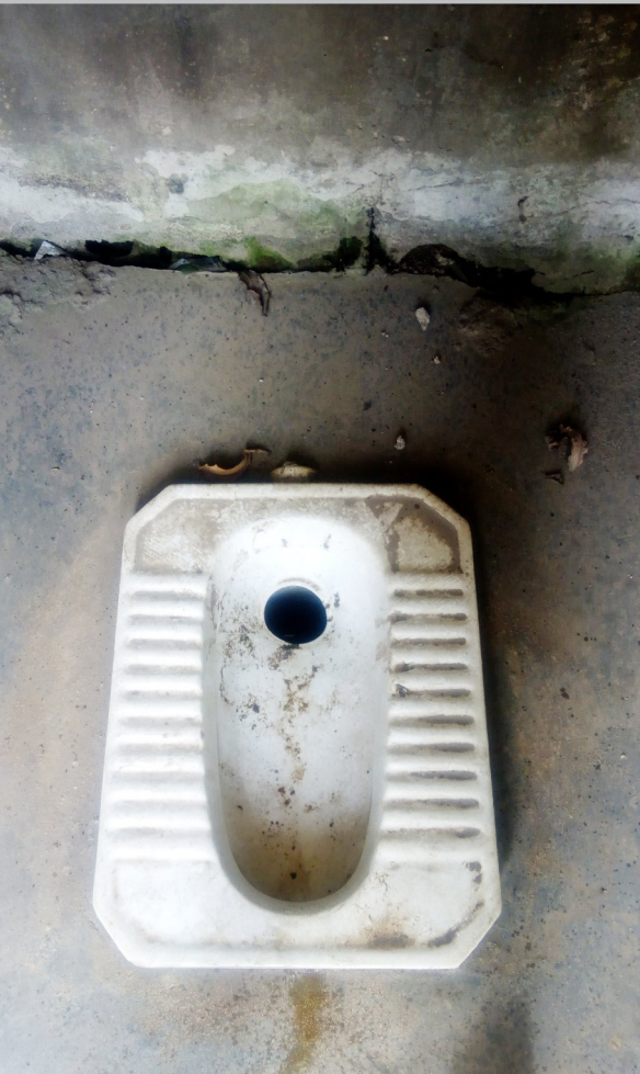
State of pit toilet at Vetland Junior Grammar School, Ifako Ijaye, Lagos