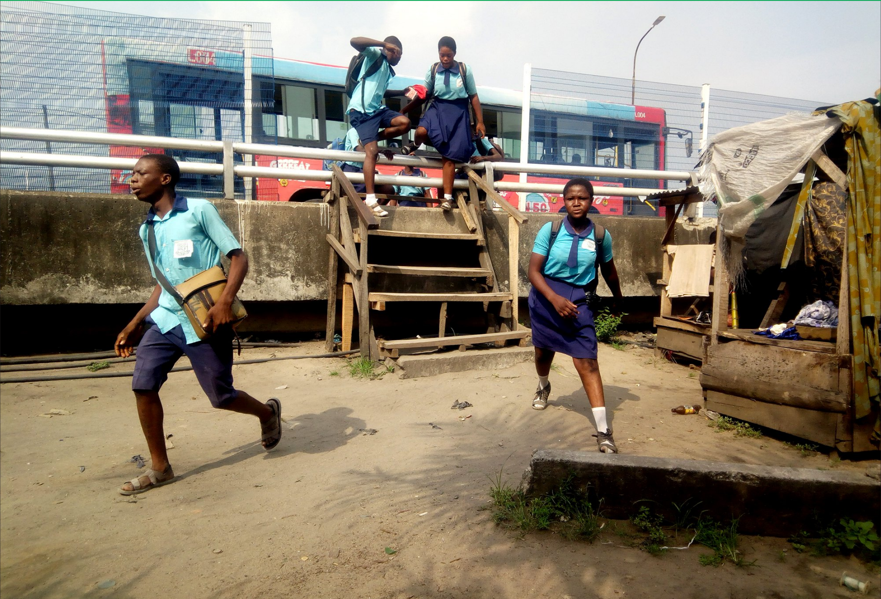
Children of Makoko Community in Ebute Meta area of Lagos passing through an elevated plank way on their way to school