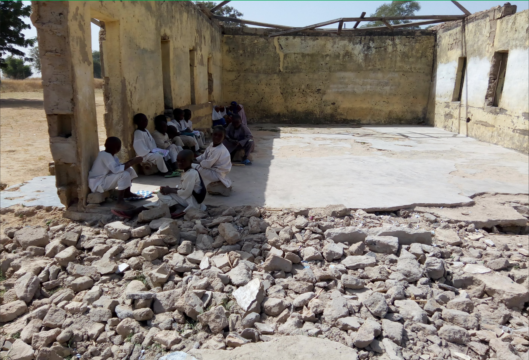
Primary 2 pupils in their class at Namaje Primary School, Karaye Local Government Area of Kano State