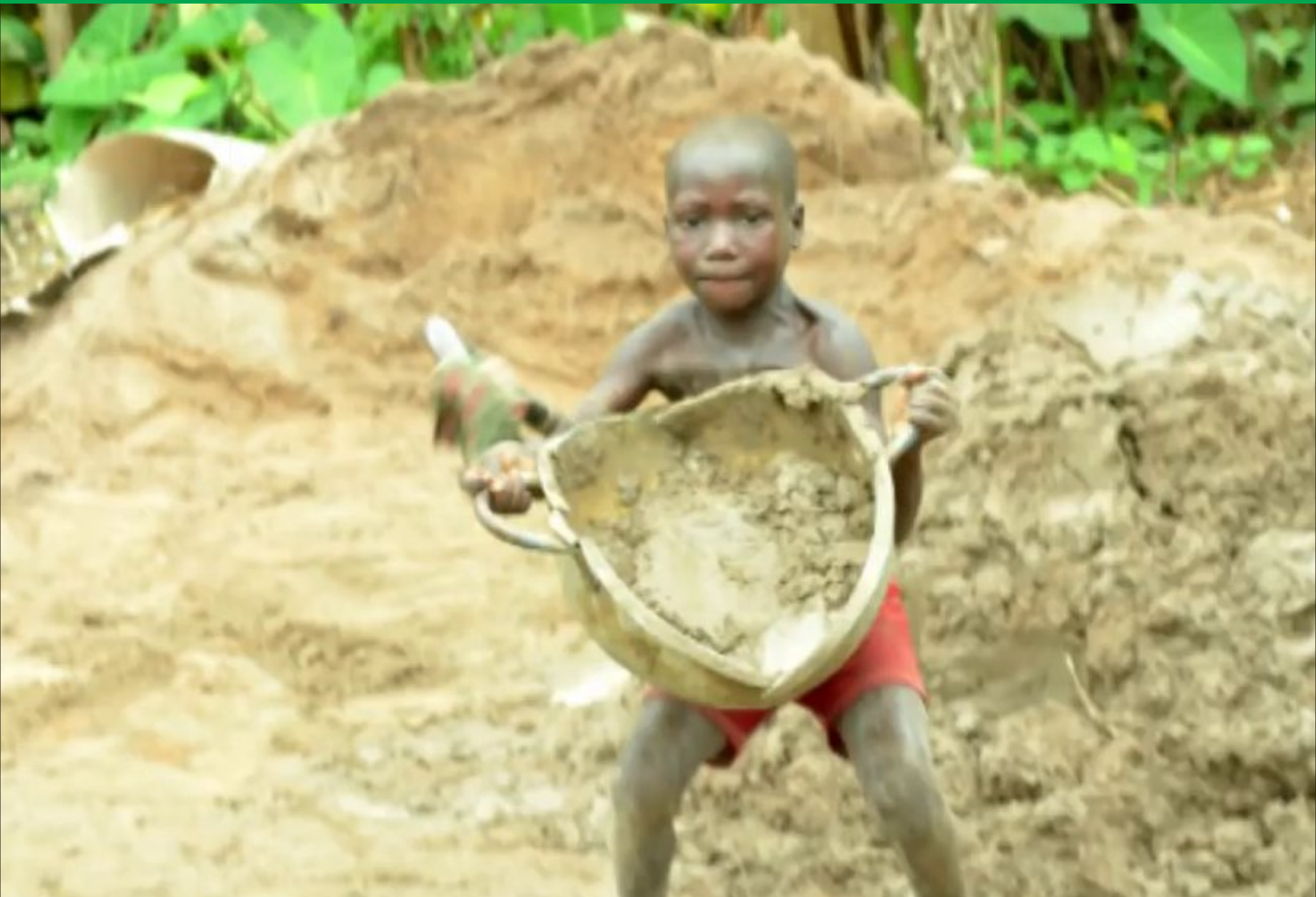
A child attempting to carry head pan containing mixed cement at Tata, Imoto-Yewa in the Yewa-North Local Government Area of Ogun State