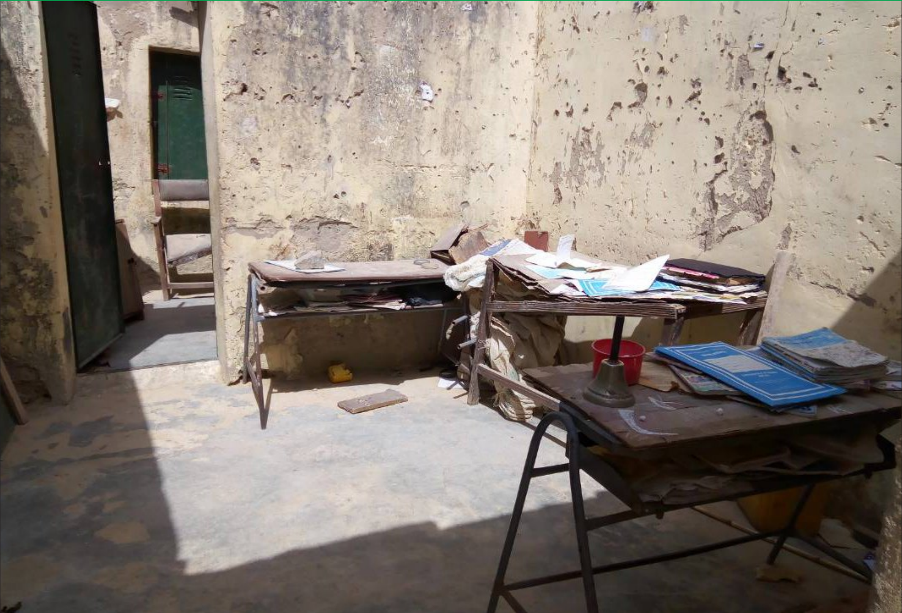
Staff room and headmaster's office at Namaje Primary School, Karaye Local Government Area, Kano State