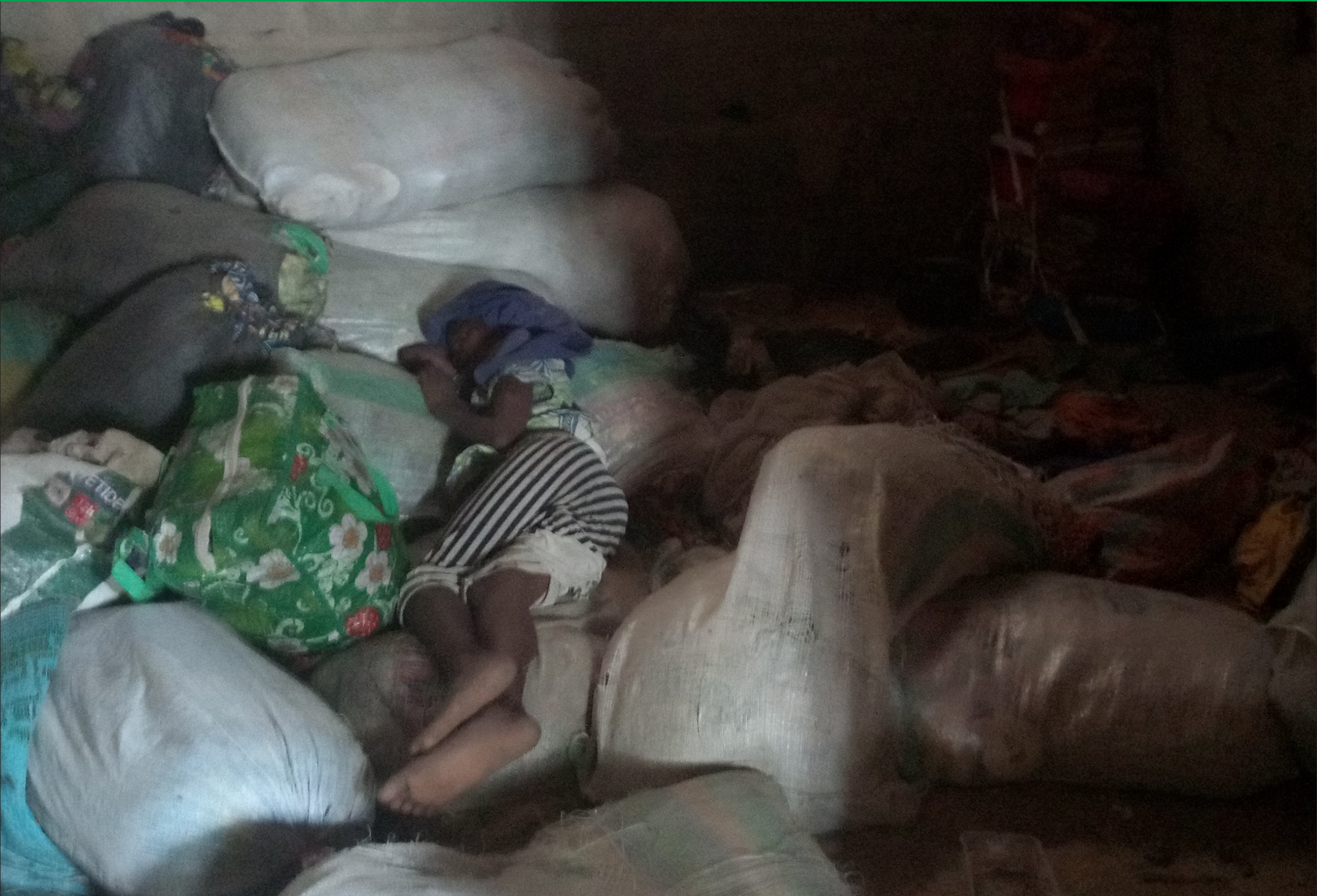
A girl sleeping in a stuffy room at Mallam Kabir Girls Almajiri School, Kebbi State