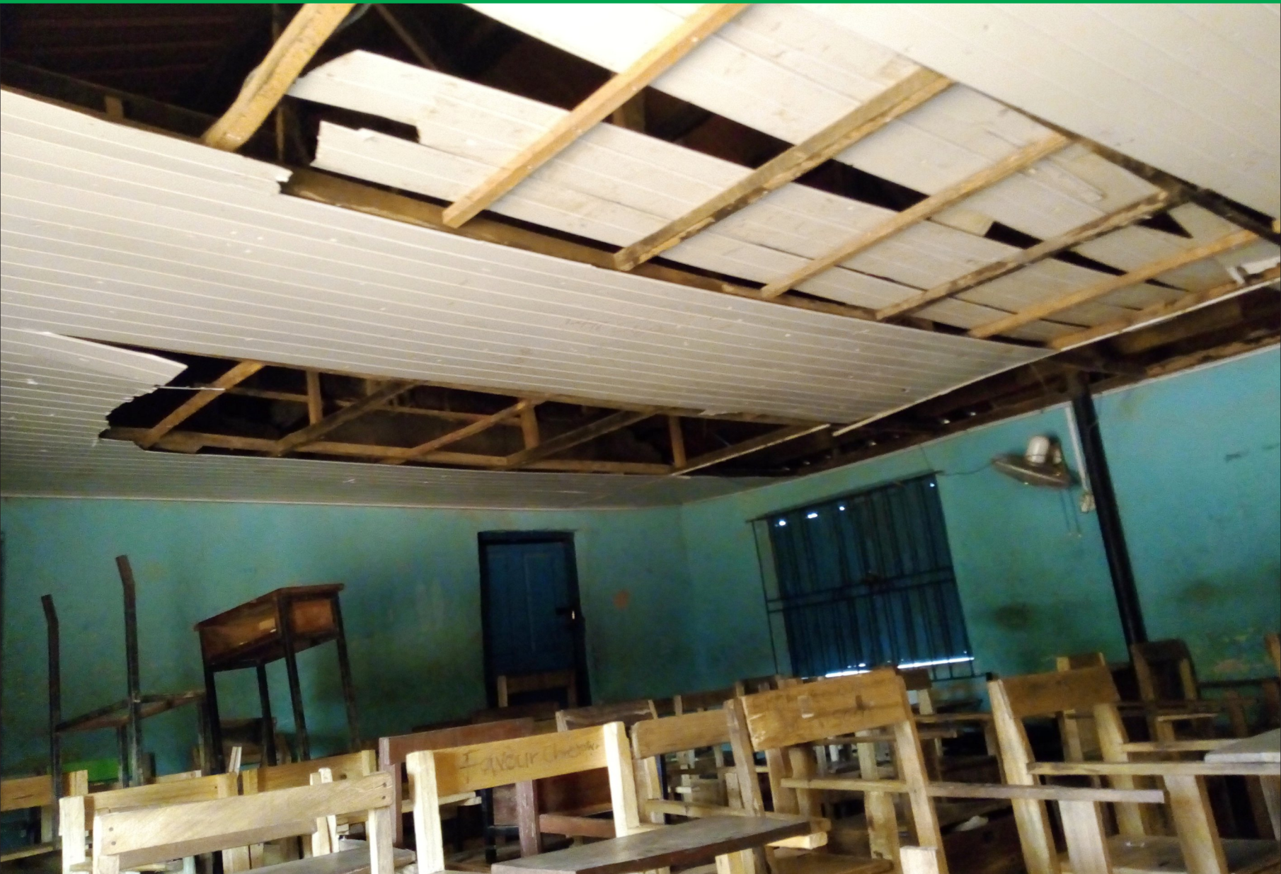
The deplorable state of some classrooms at Ajumoni Senior Grammar School, Okota area of Isolo, Lagos