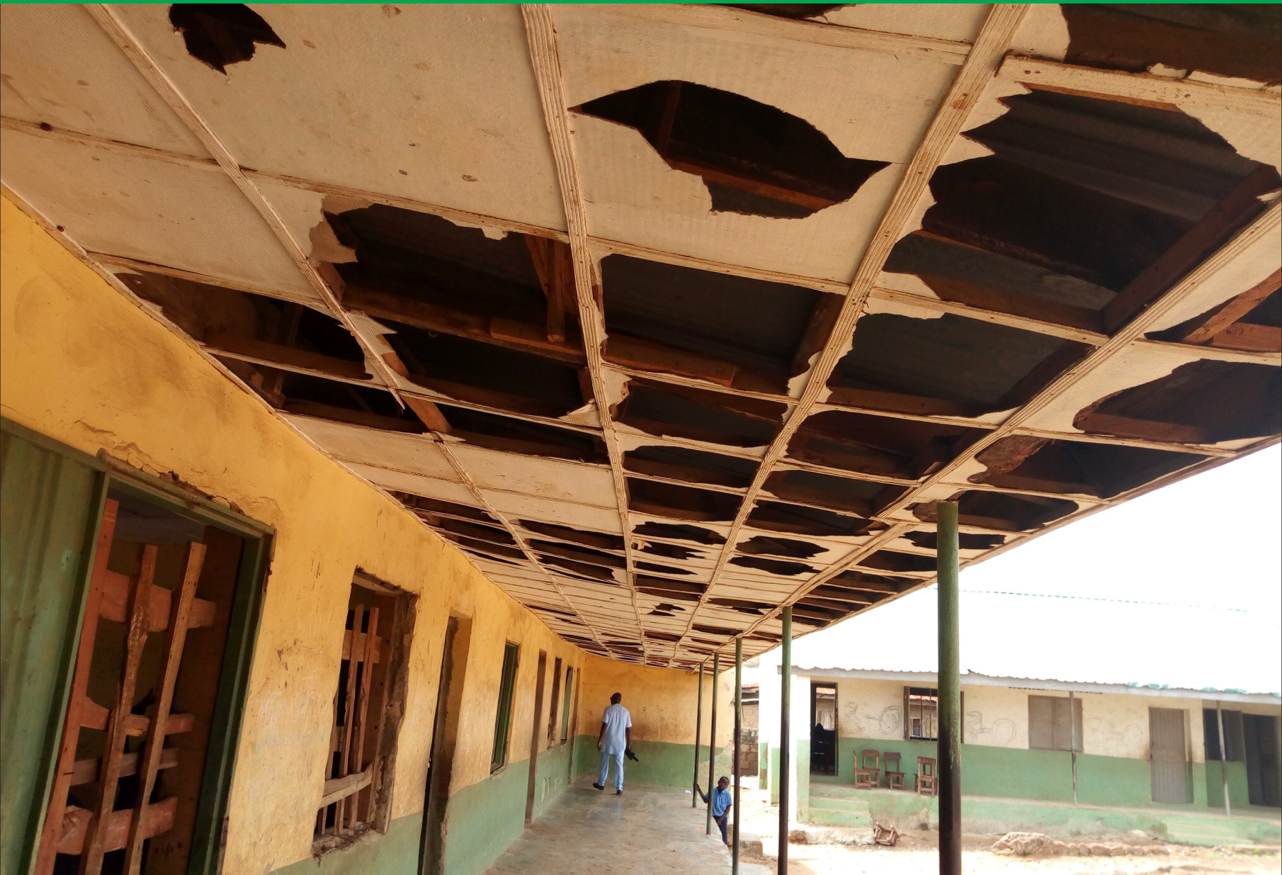
A dilapidated block of classrooms in Abata Gambari Junior Secondary School, Ilorin East Local Government Area, Kwara Central Senatorial District, Kwara State