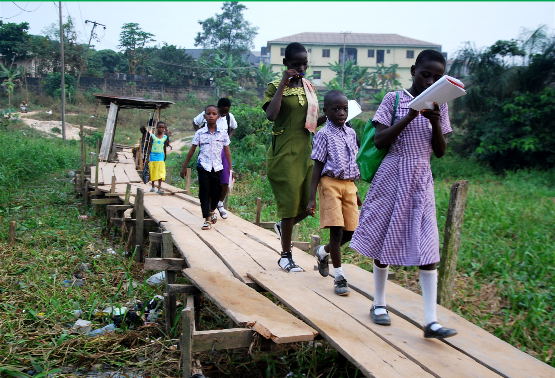
Pupils of Fred Williams Primary School, Iju-Isaga, Ogun State, trekking several kilometres to receive education