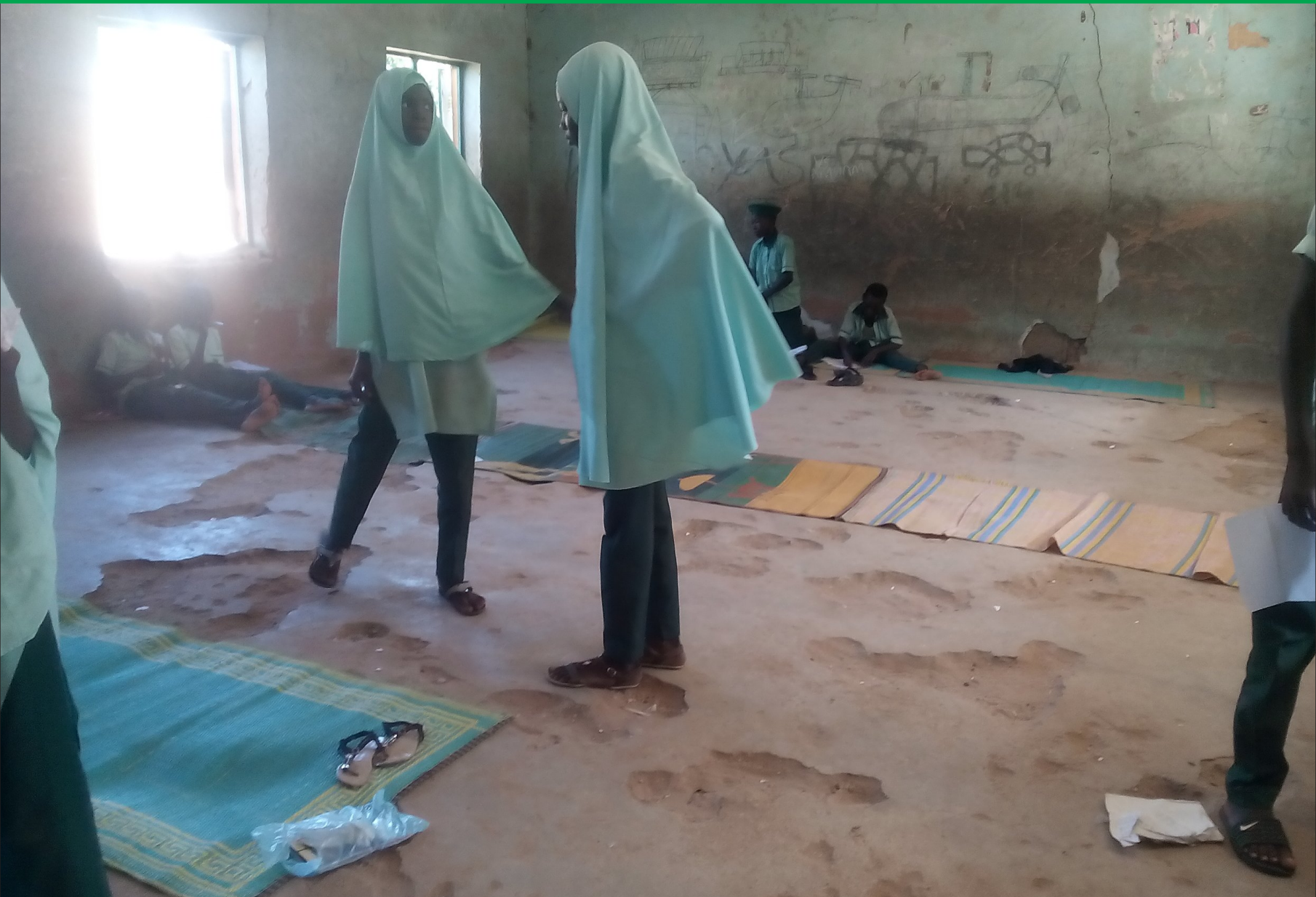
JSS1 students at Upper Basic Alkaleri, Alkaleri Local Government of Bauchi State, sitting on rubber mats in class