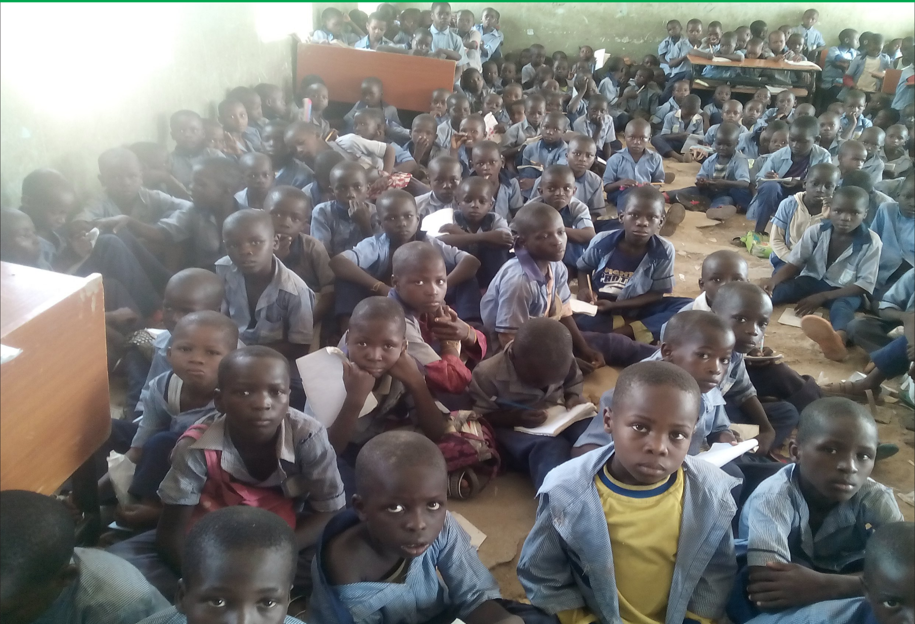
320 pupils jam-packed in a class at Ibrahim Bako Primary School, which shares perimeter fence with the Bauchi State House of Assembly