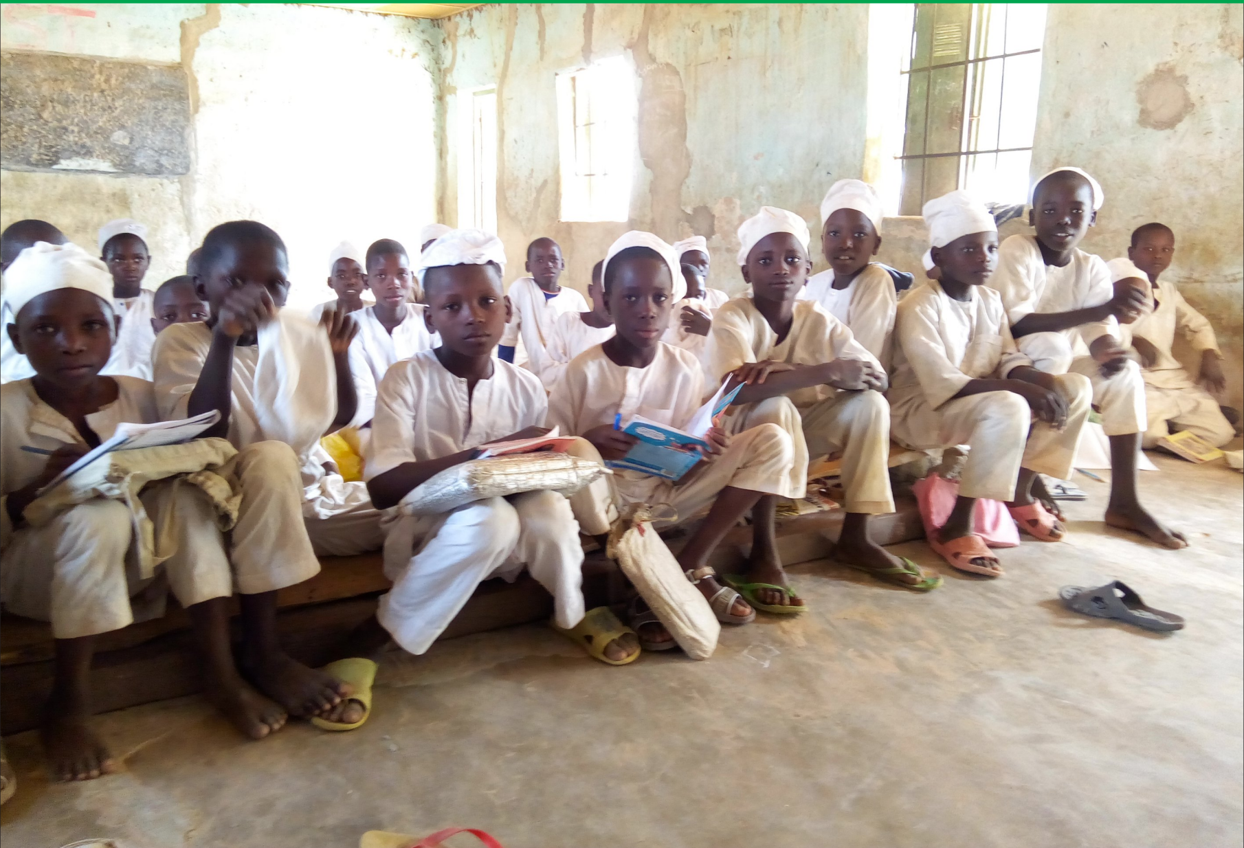
JSS 1 pupils sitting in their classroom with no furniture at Gawo Junior Secondary School, Gezawa Local Government Area, Kano State