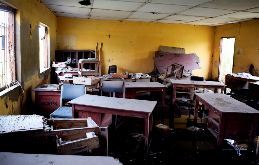
Staffroom of the Ajegunle Junior and Senior High School Ikorodu Road in Kosofe Local Government Area of Lagos