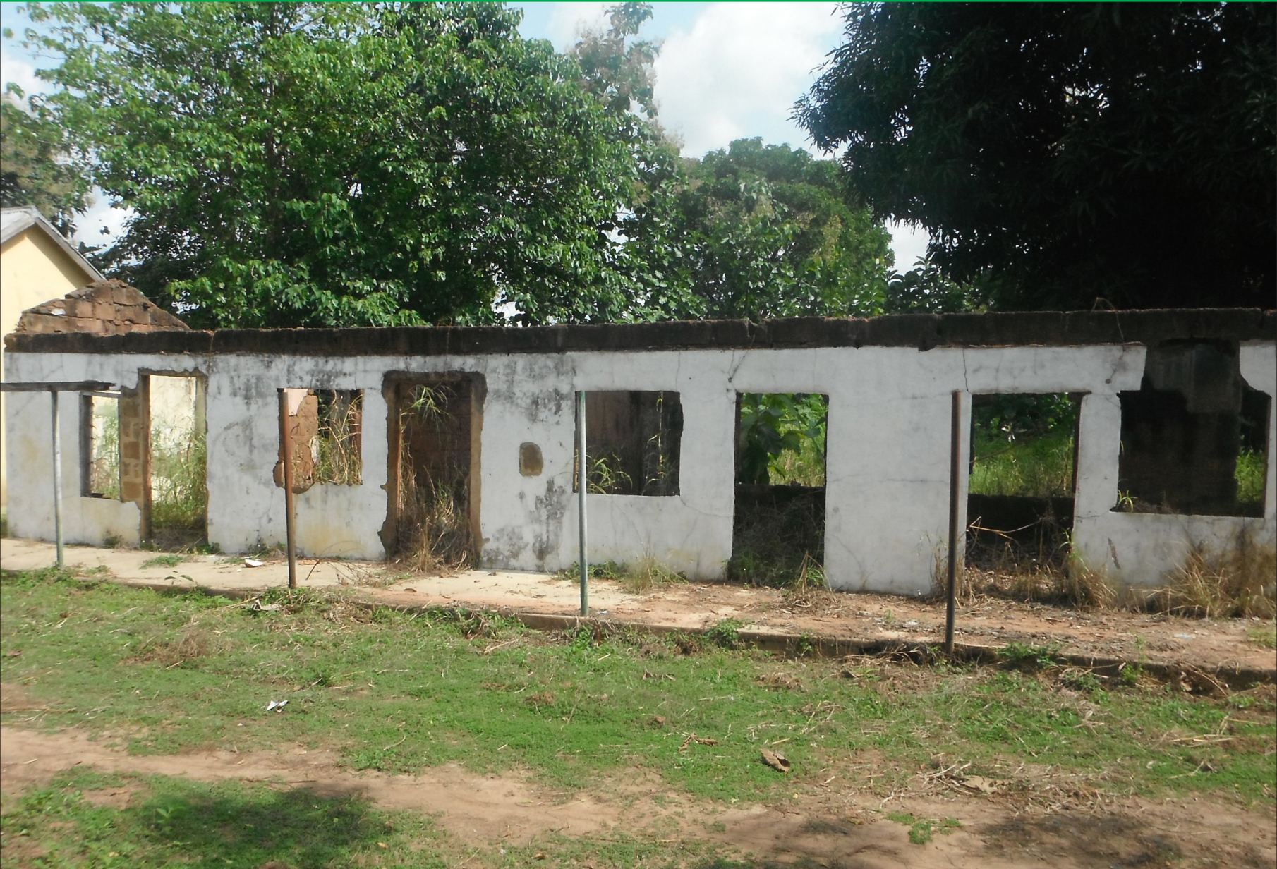
A vandalized structure by suspected herdsmen at Tombo Community Secondary School, Logo Agatu Local Government Area, Benue State