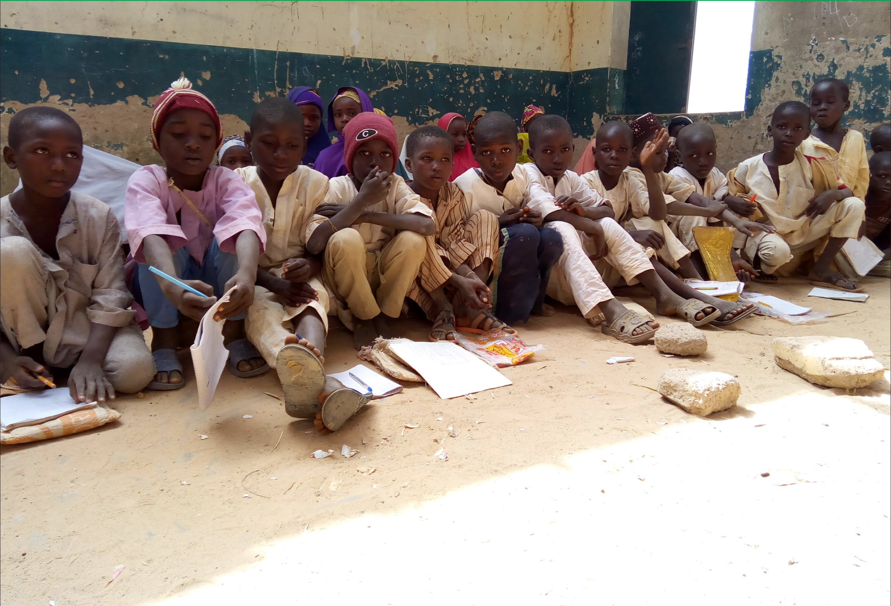
Primary 3 and 4 pupils take lessons together at Gawo Primary School, Gezawa Local Government Area, Kano State