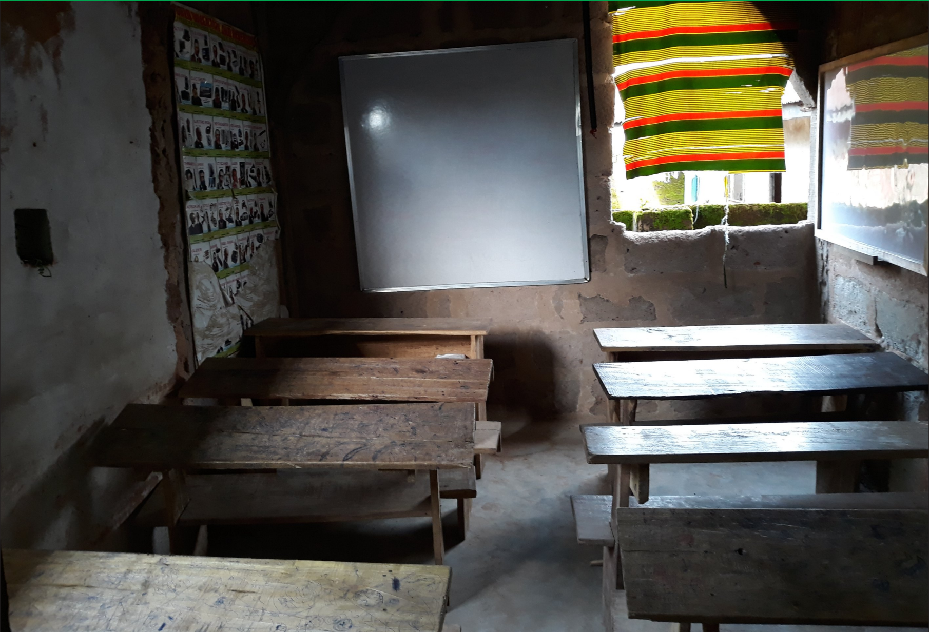
Classroom at New Generation Group of Schools in Benin City