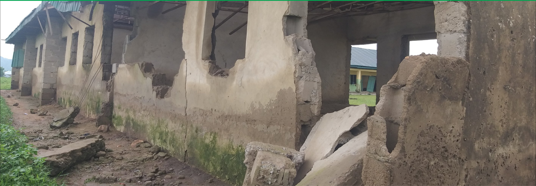
An abandoned block of classroom in JSS Paikon Kore, Gwagwalada Area Council, FCT