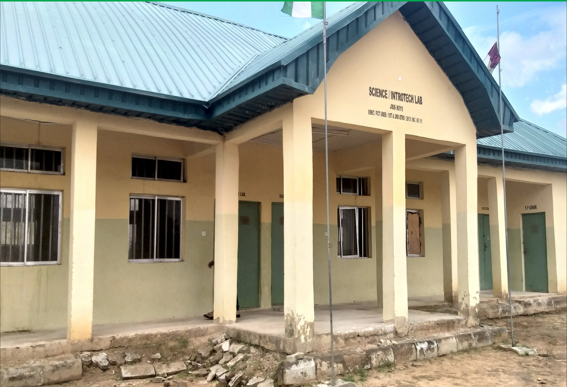
A science laboratory built without equipment, now used as staff room for senior teachers in Junior Secondary School, Kiyi in Kuje, FCT, Abuja