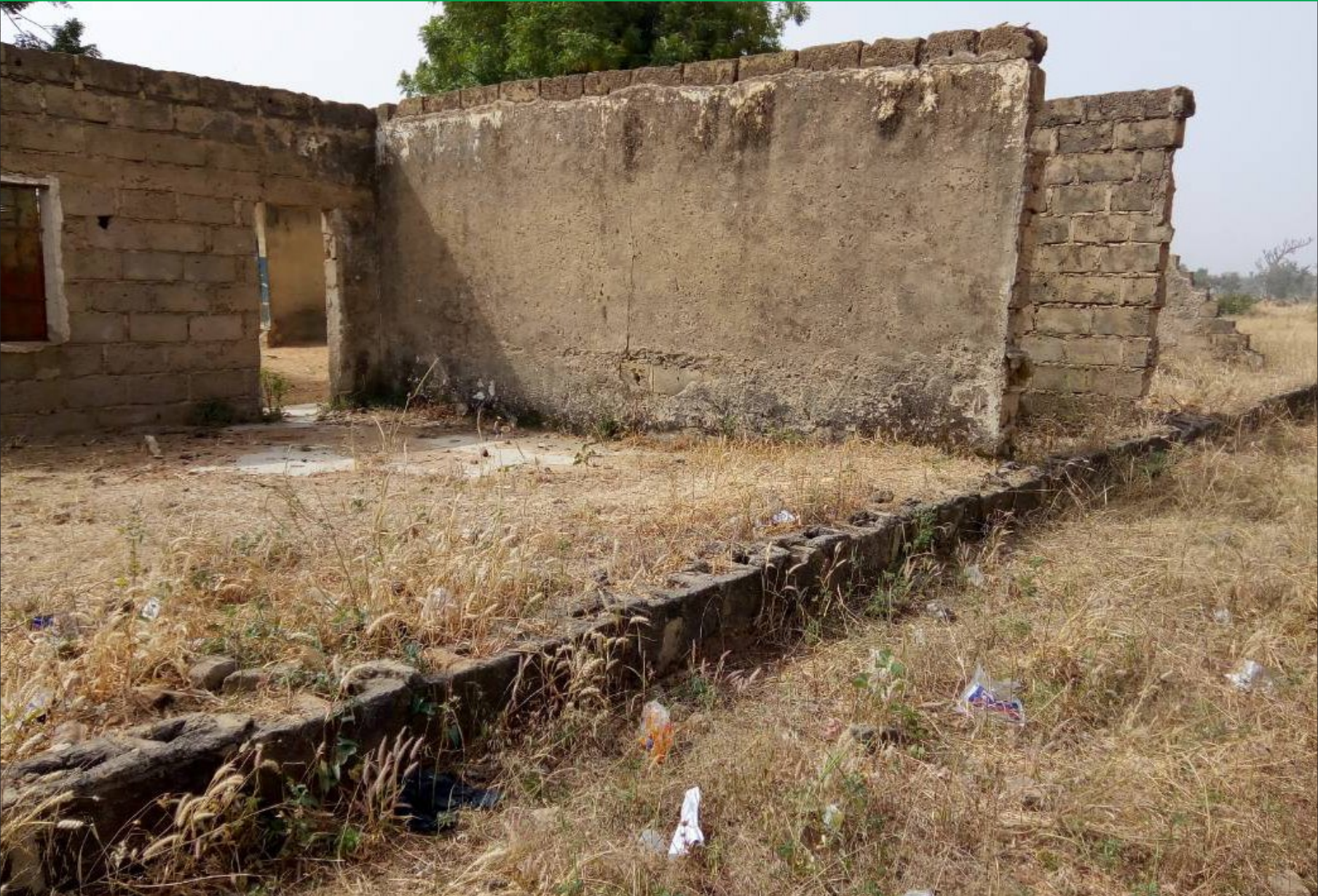
A dilapidated classroom at Gawo Primary School, Gezawa Local Government Area, Kano State