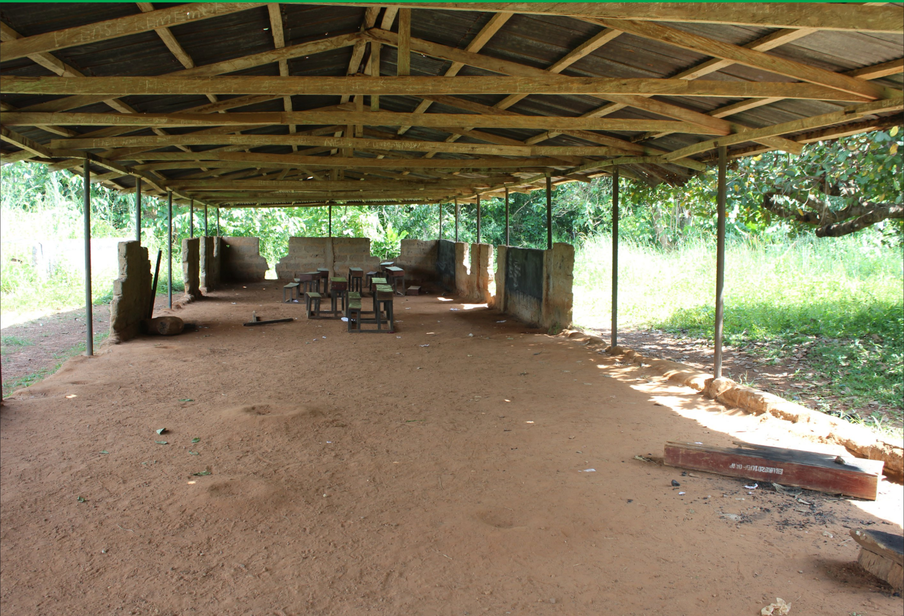
Collapsed and abandoned classroom at Primary School Abonyi Okpoto in Ishielu Local Government Area, Ebonyi State