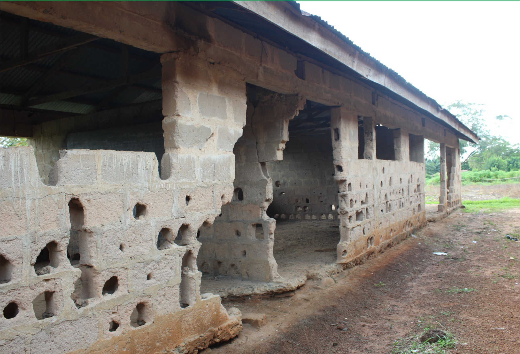
A dilapidated building at Primary School Isimkpuma, Ndieze Okpoto in Ishielu Local Government Area, Ebonyi State