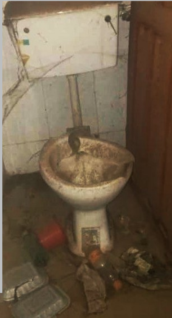
Millennium Secondary School, Egbeda, Lagos