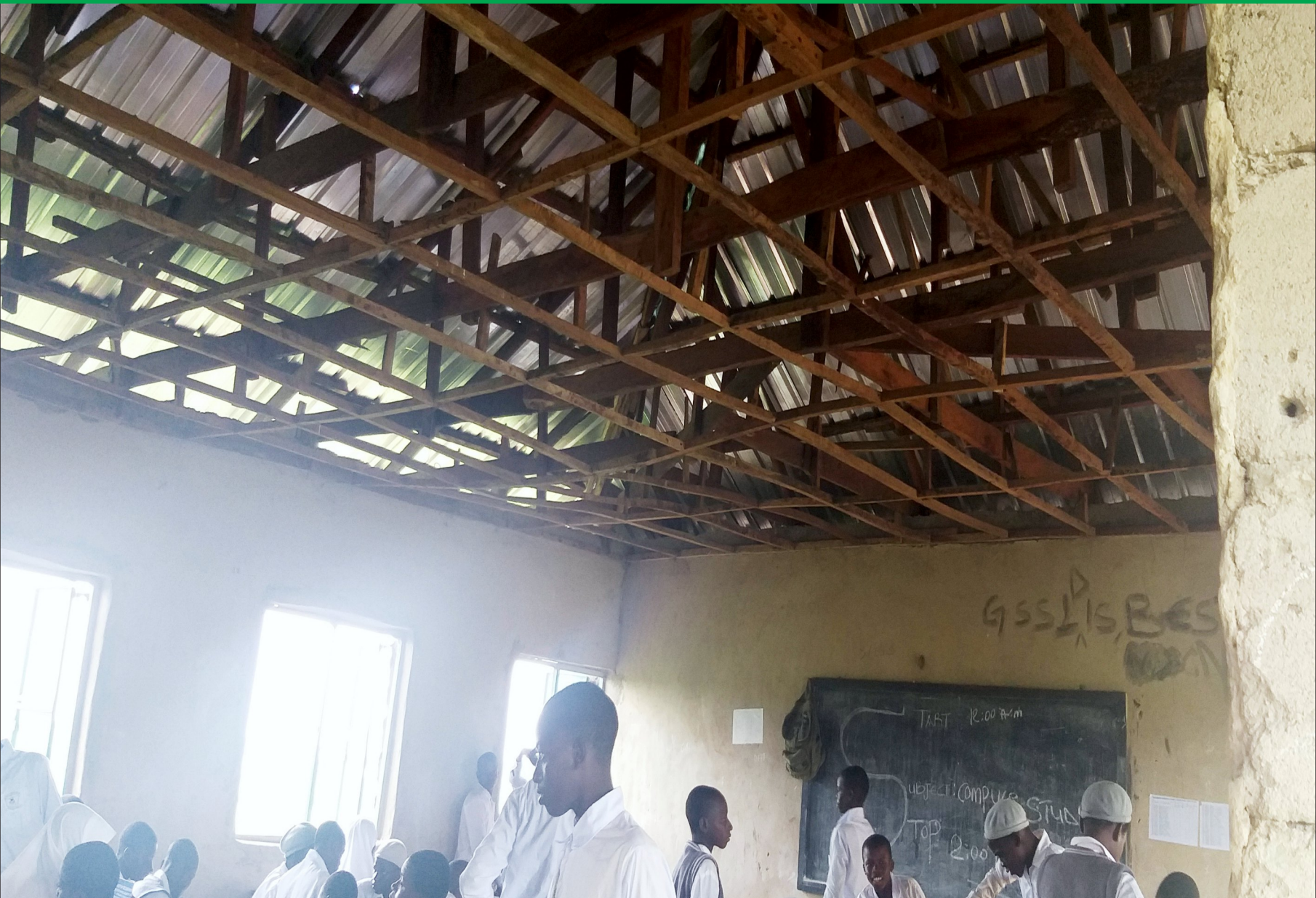
Students of JSS Paikon Kore, Gwagwalada Area Council, FCT, Abuja, learning in an uncompleted classroom