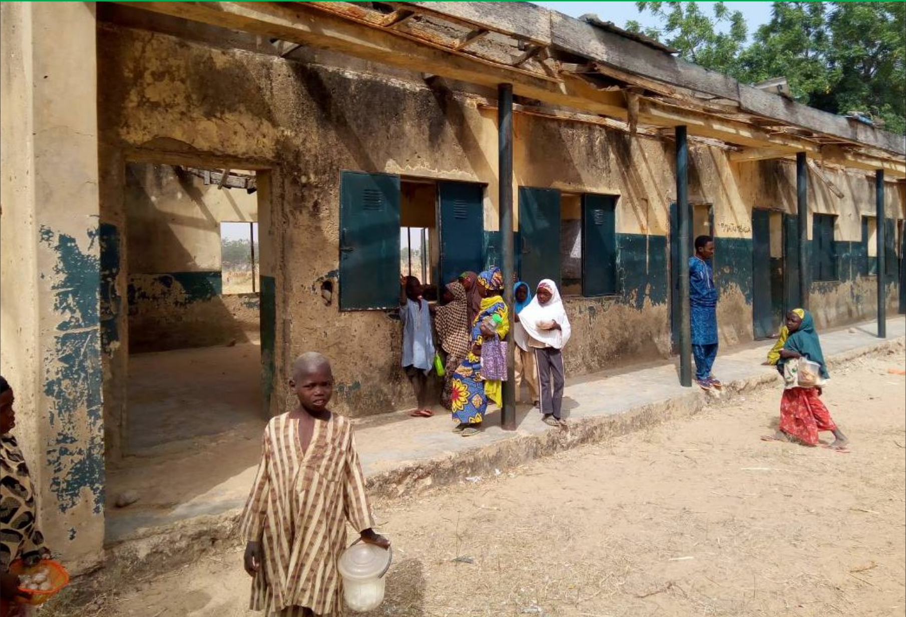
A block of classrooms which accommodate Primary 3-6 pupils of Gawo Primary School, Gezawa Local Government Area, Kano State