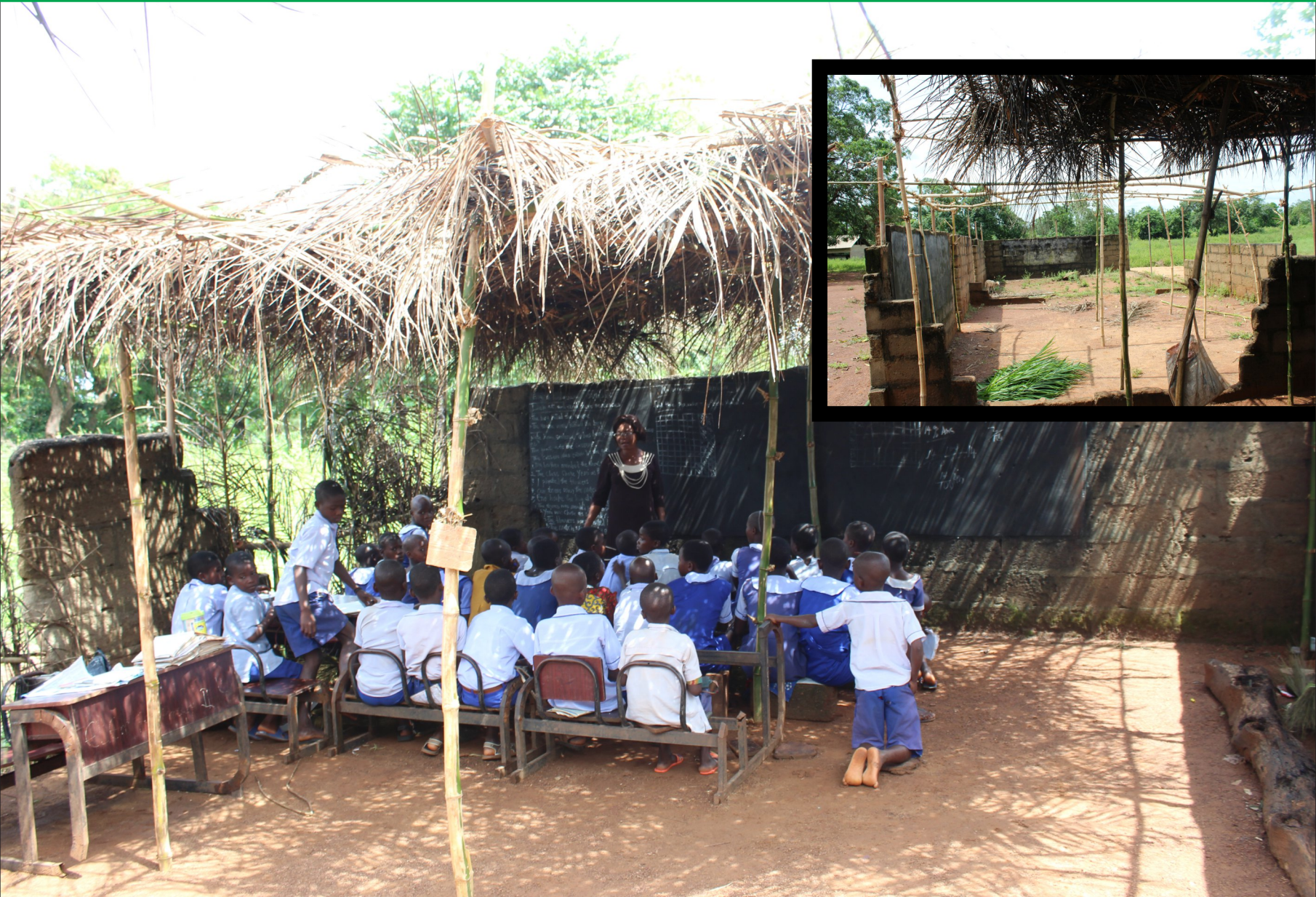
Pupils learning under bamboo palm at Ojigbe Primary School in Izzi Local Government Area, Ebonyi State, after the school building collapsed. Inset: Part of the collapsed building at Ojigbe Primary school in Izzi Local Government Area, Ebonyi State