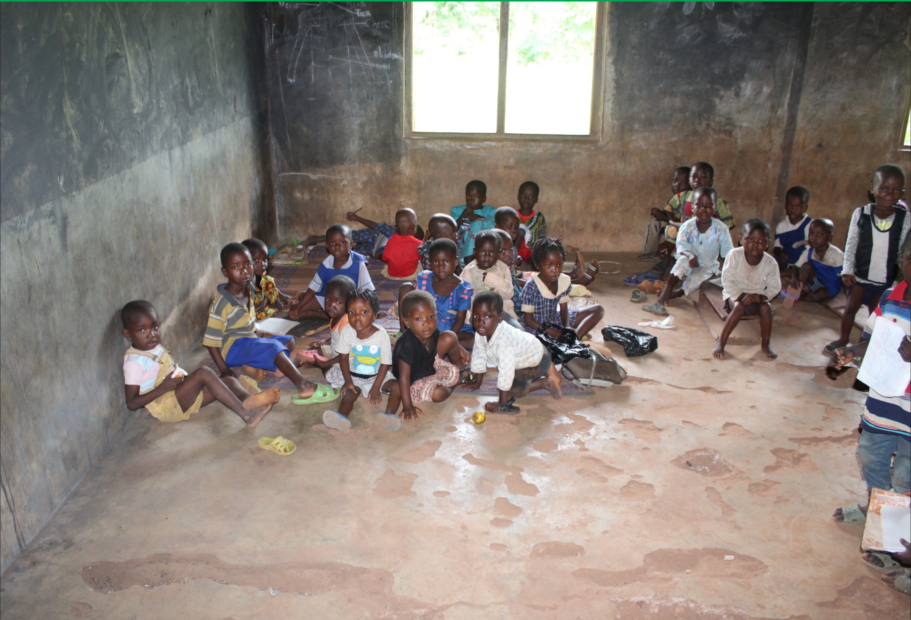
Pupils of Practical School Igbeagu in Izzi Local Government Area, Ebonyi State of Nigeria sitting on the floor