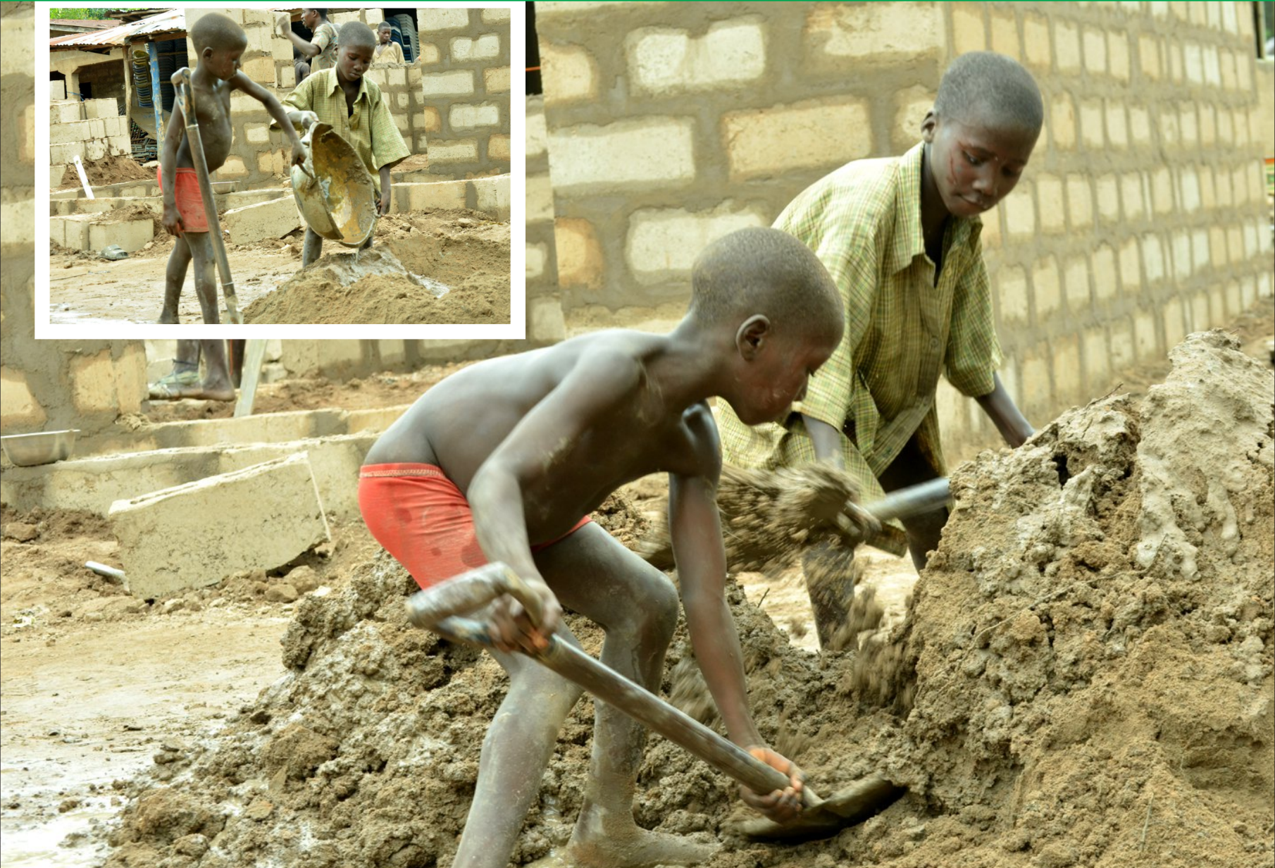
Children doing bricklaying during school hours at Tata, Imoto-Yewa in the Yewa-North Local Government Area of Ogun State