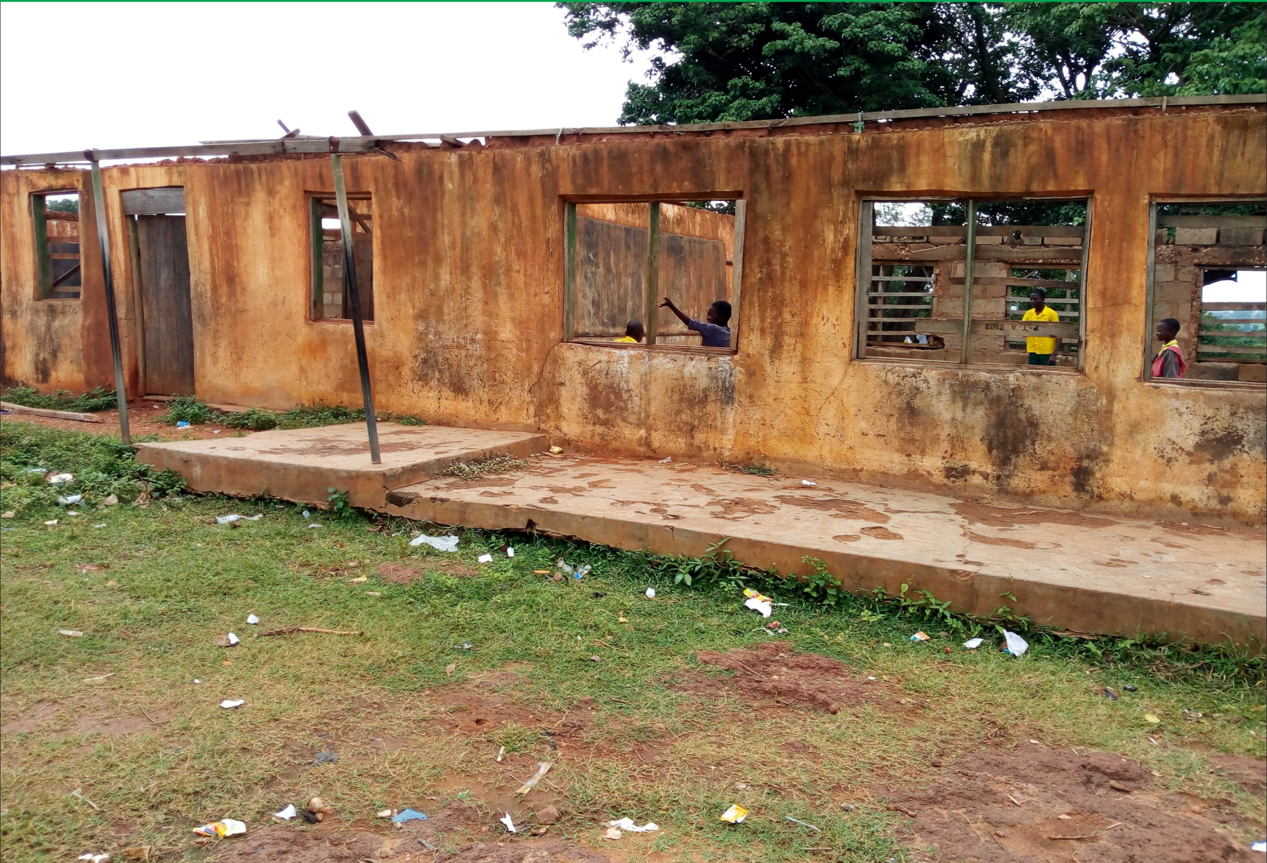
A block of classrooms in a state of disrepair at LGEA School Tepatan, Moro Local Government Area, Kwara North Senatorial District, Kwara State