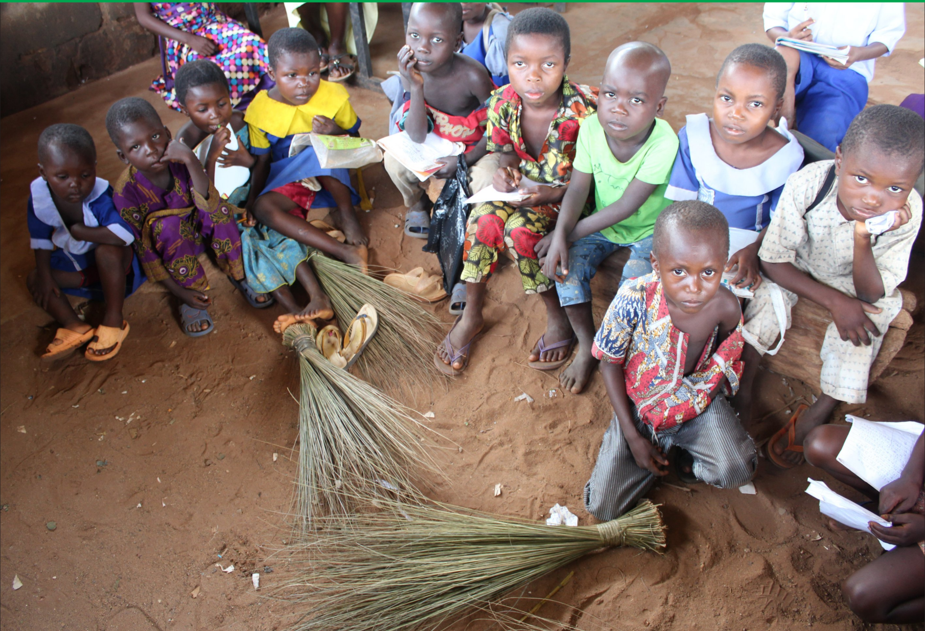
Pupils of Pratical School Igbeagu in Izzi Local Government Area, Ebonyi State, Nigeria, sitting on the floor to learn