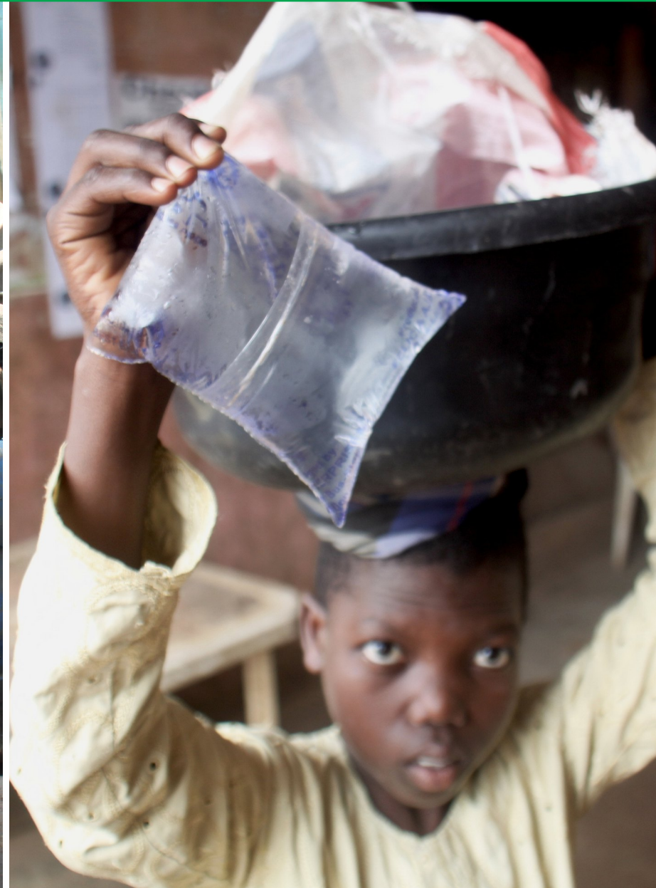
A child hawker at Agbado Crossing, Ogun State