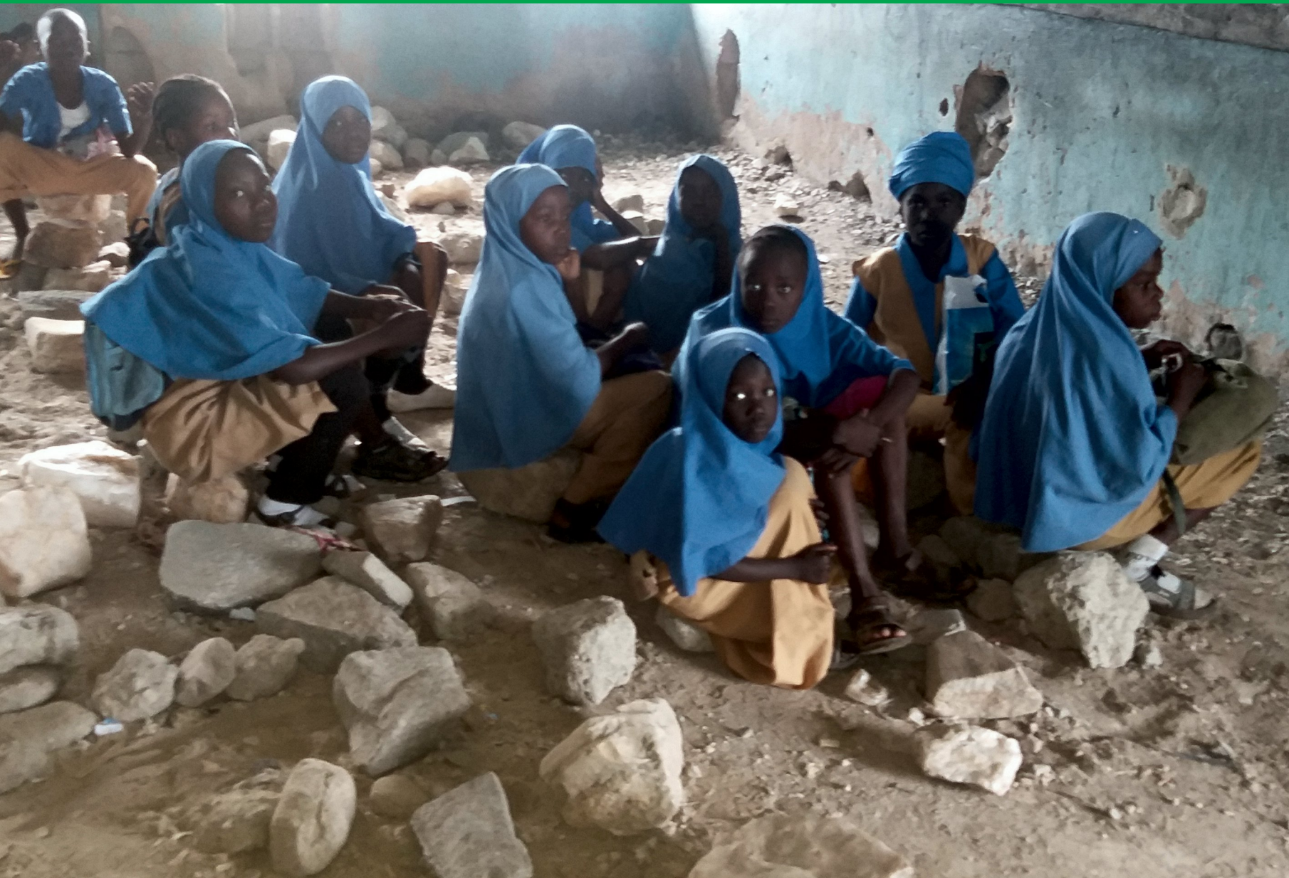
Pupils of Kofar Hausa Primary School, Keffi, Abuja, learning in a dilapidated classroom