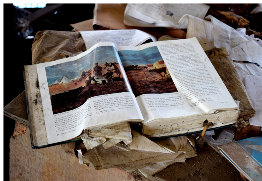
A flooded school library