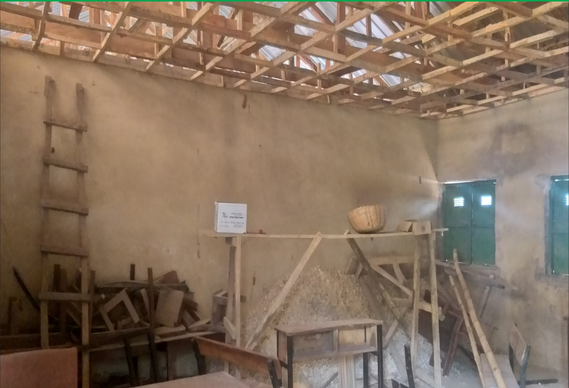
An abandoned classroom in Narati Tsoho in Abaji Area Council, FCT