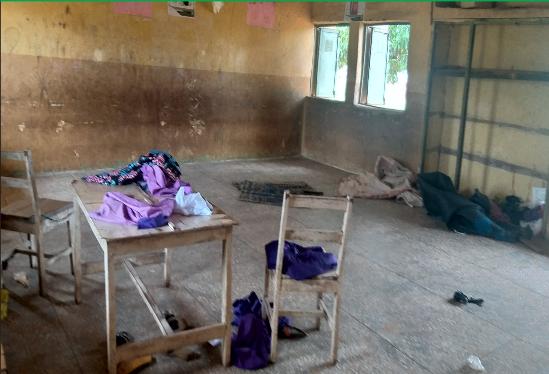
Classroom for early child education in Abaji Model School, Abuja