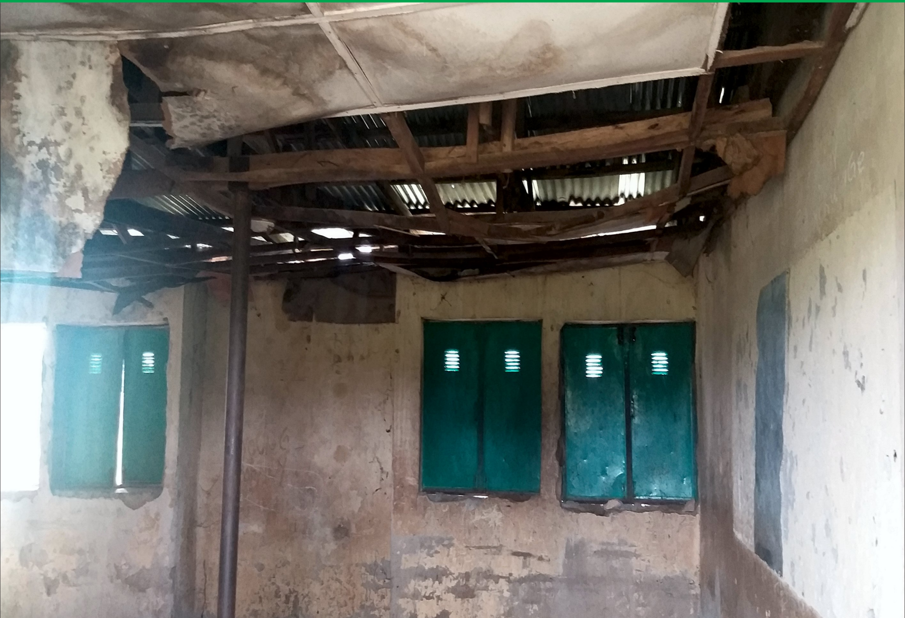
A dilapidated classroom in Gora Primary School, Nasarawa State