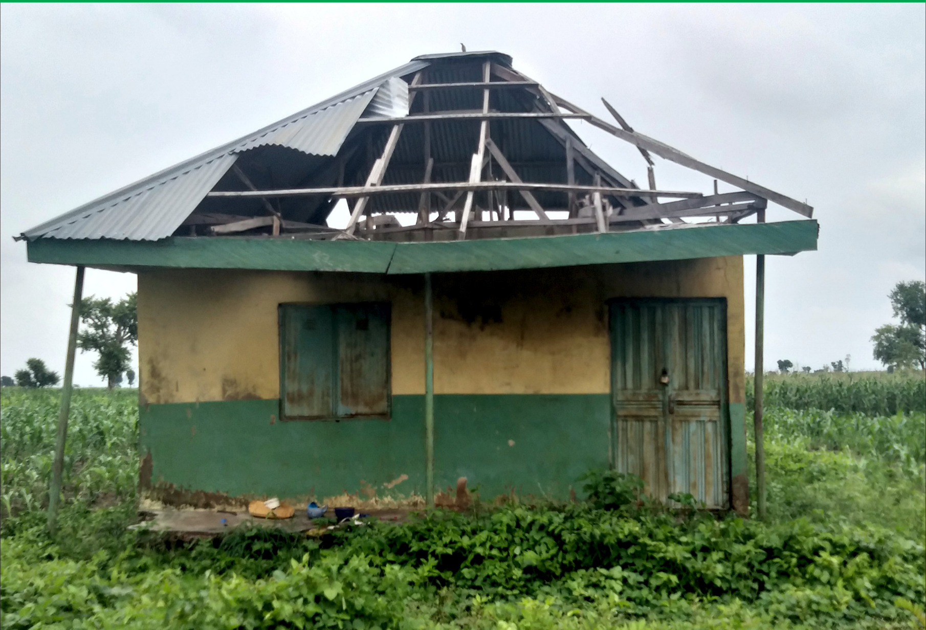
A toilet built and never put to use in JSS Gwako, Gwagwalada, Abuja, while students use the bush