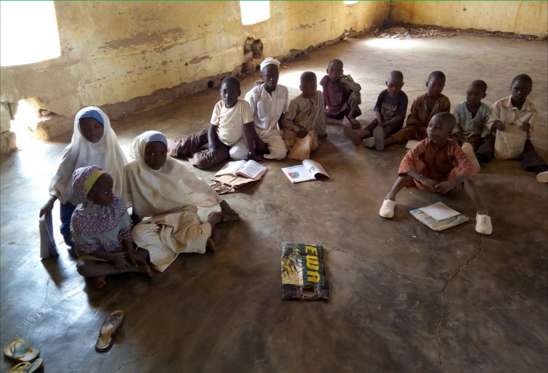
Some Primary 2 pupils at Husama Primary School, Karaye Local Government Area of Kano State