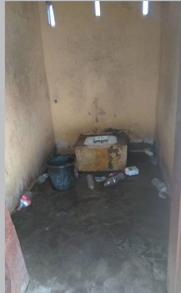
Another toilet at Community Junior High School Akodo –Orofun, Lekki Town, Lagos