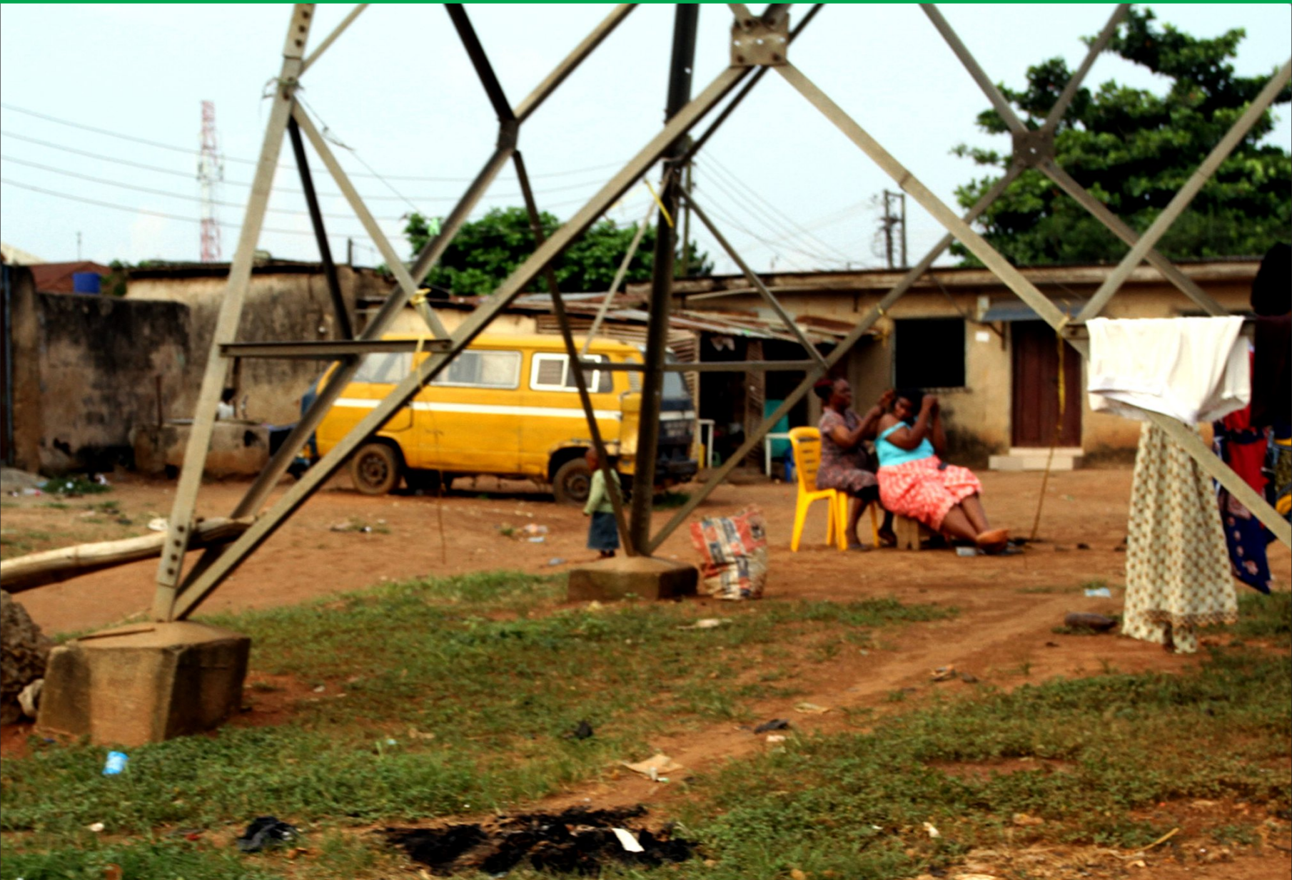
A resident has her hair done beside high tension tower on Bakare Street, Idimu in Alimosho Local Government Area of Lagos