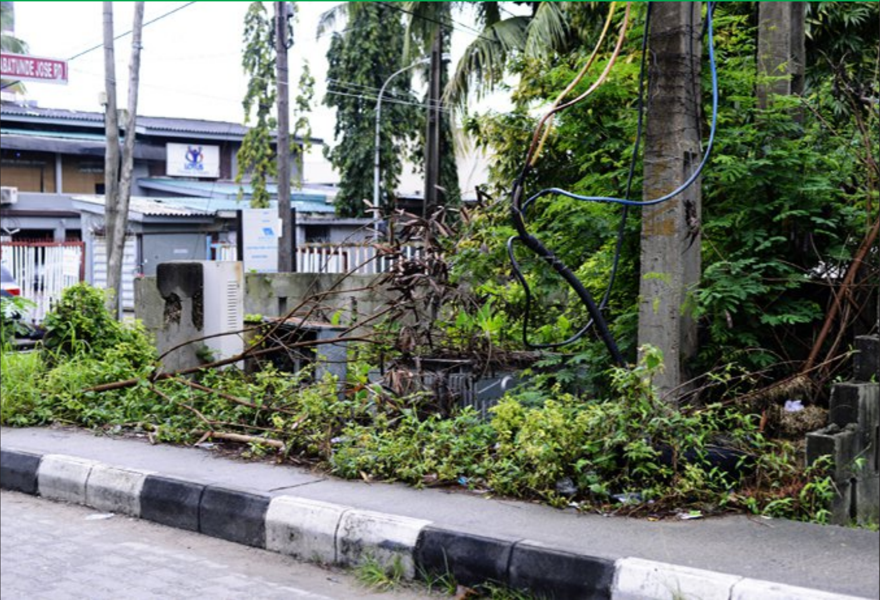
Exposed electric cables at Babatunde Jose junction, Samuel Manuwa Street in Victoria Island, Lagos