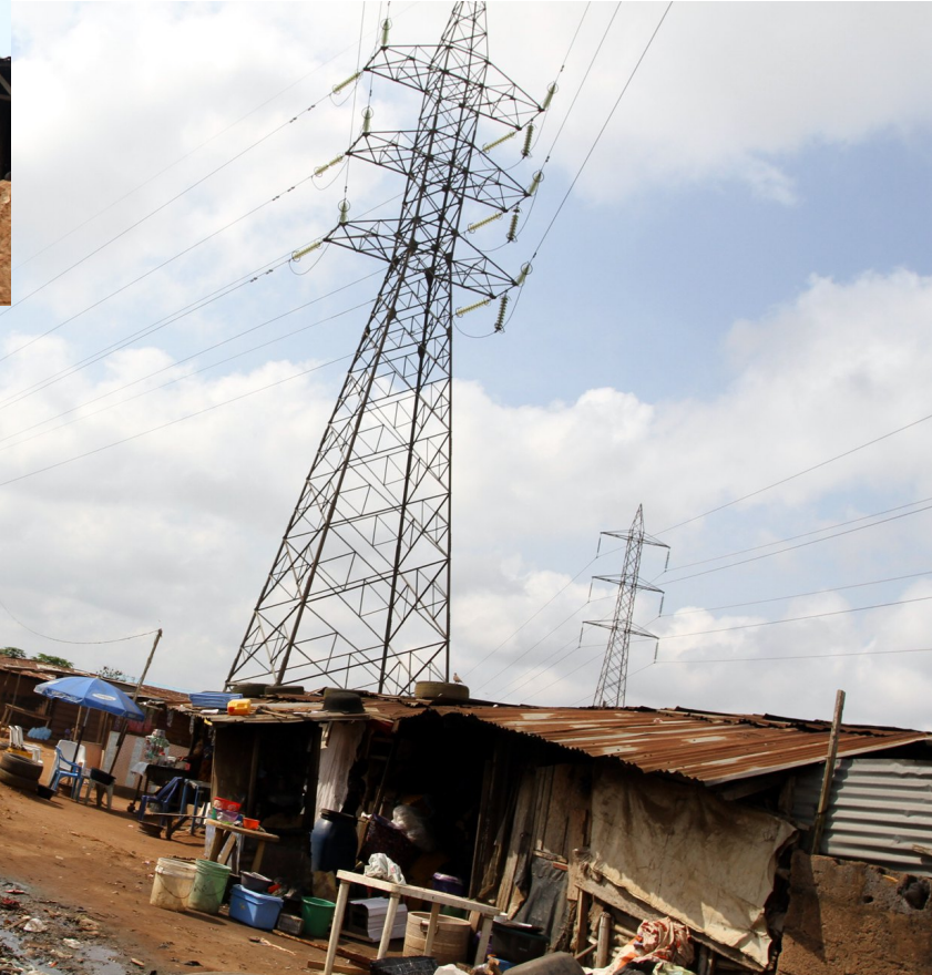
Buildings under high tension tower on both sides of Bakare Street, Idimu, under Alimosho Local Government in Lagos