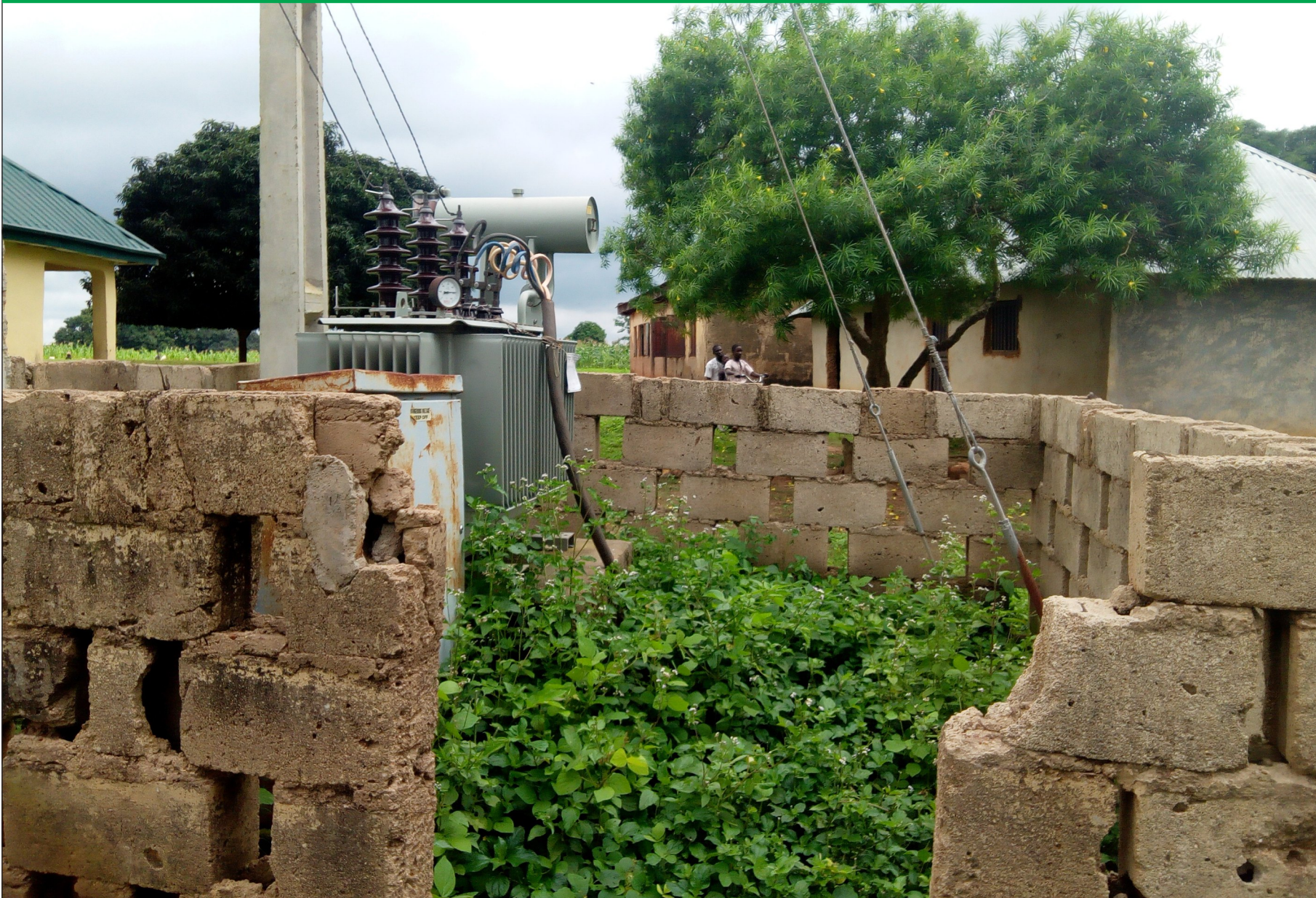
The transformer in Chiri community, Gwada, Shiroro Local Government Area overridden by grasses