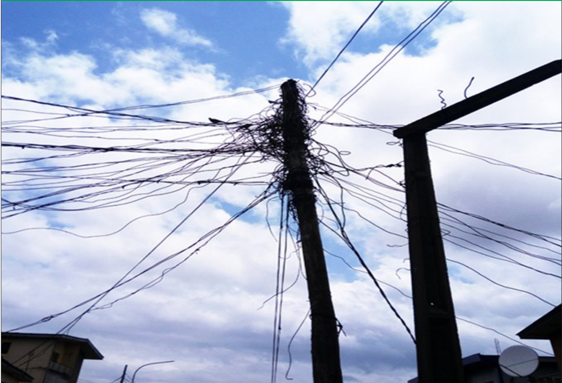
Damaged pole and clumsy cable at Unity Street, Off Toyin Street, Ikeja, Lagos