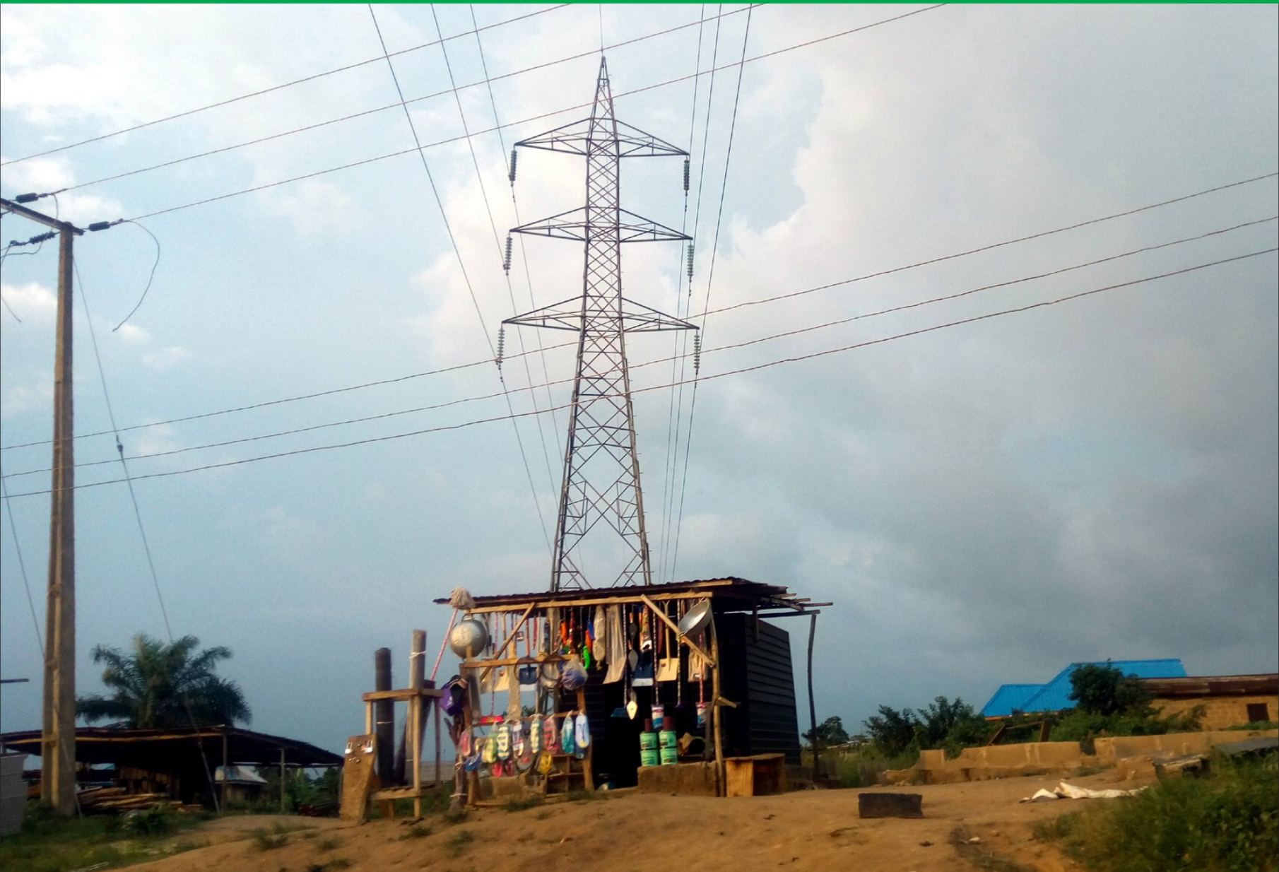
A shop directly under high tension cables on Sojuolu Road in Ifo, Ogun State