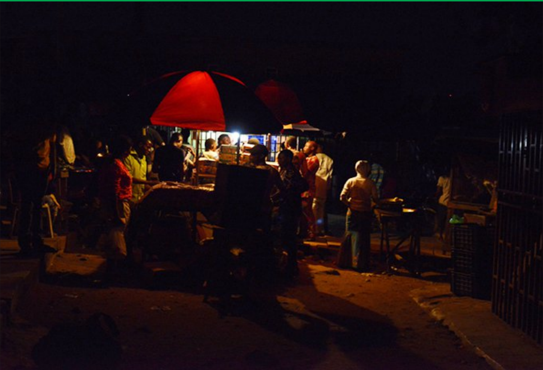
Bread seller lights his stand with a small generator at Iyana-Ipaja, Lagos.