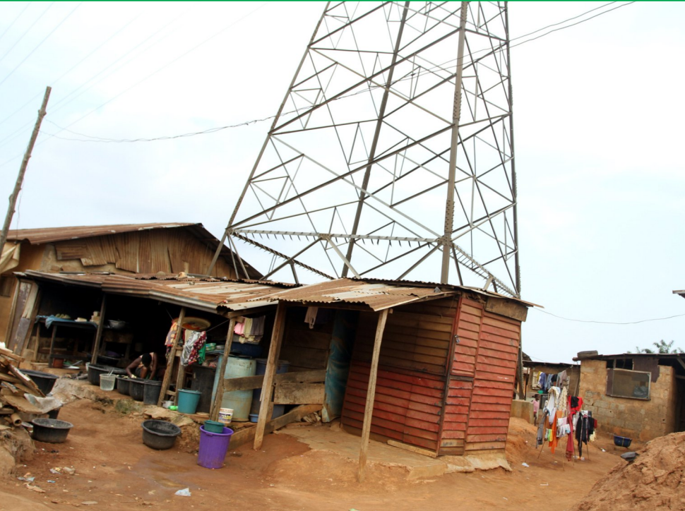
A residential building and a shop under a high tension tower on Bakare Street, Idimu in Alimosho Local Government Area of Lagos