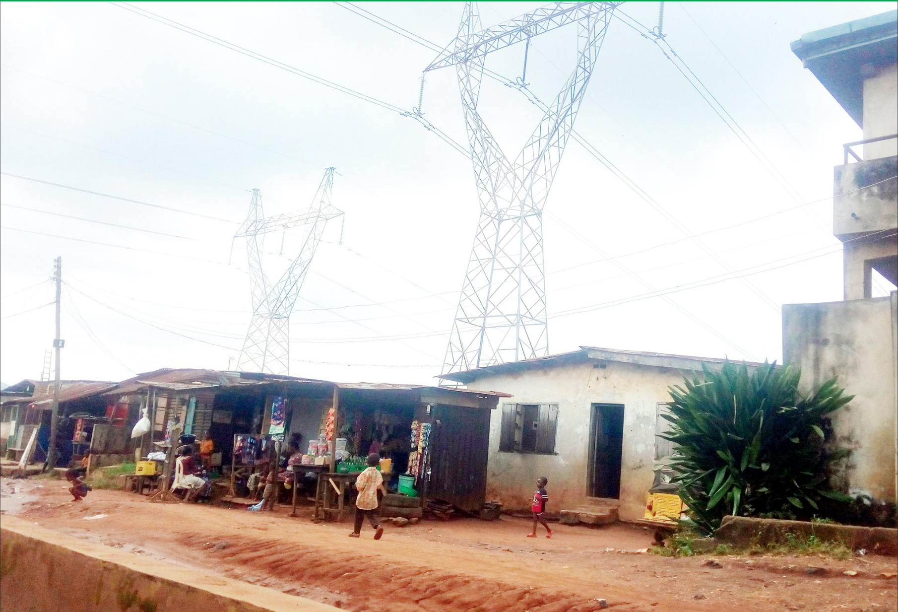
Buildings under high tension cables on 32, Ezekiel Olubi Street, Omiyale, Iyana Ejigbo in Lagos