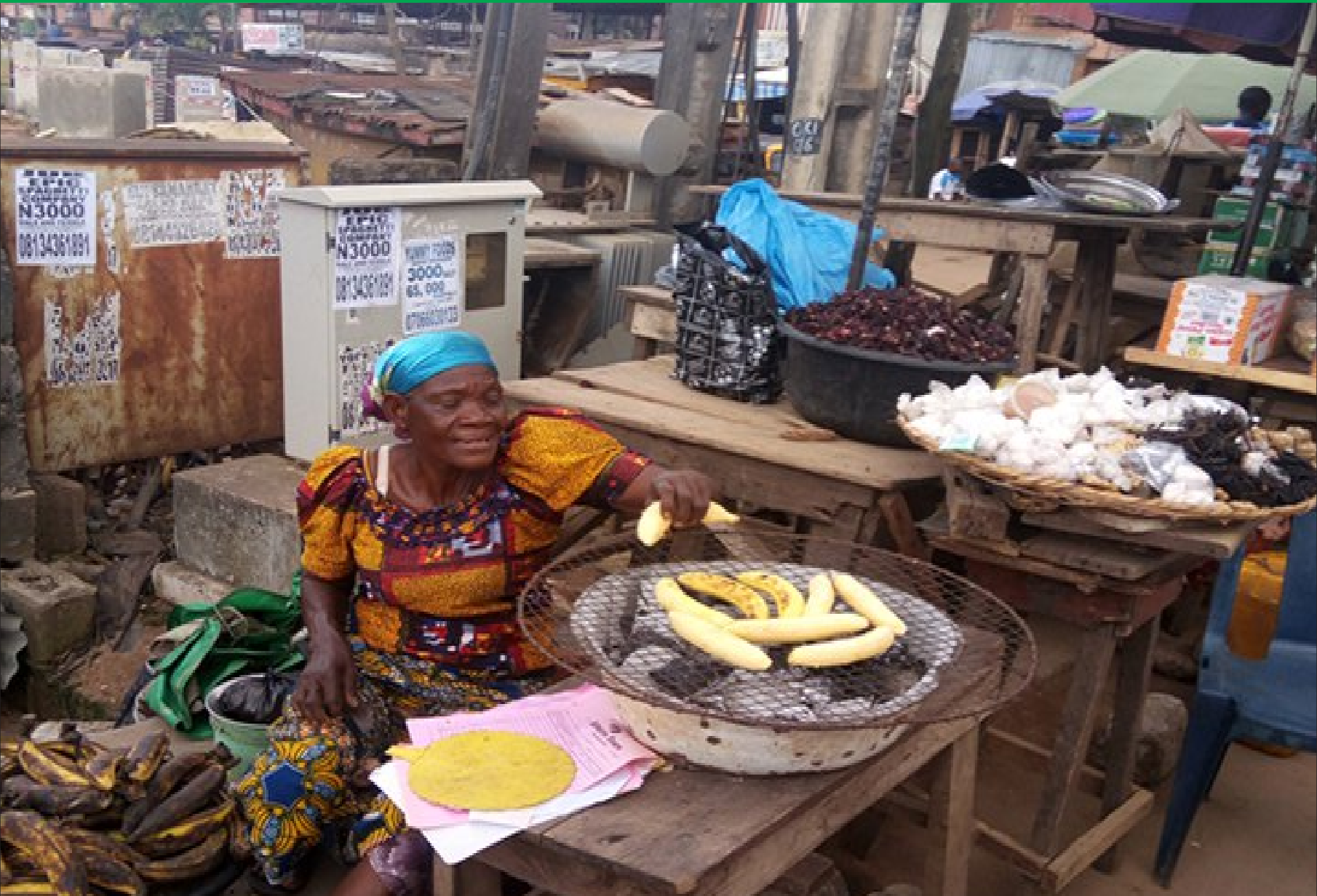
A woman turns unfenced transformer to stand for roasting plantain at Oki Junction, Iyana-Ipaja, Lagos.