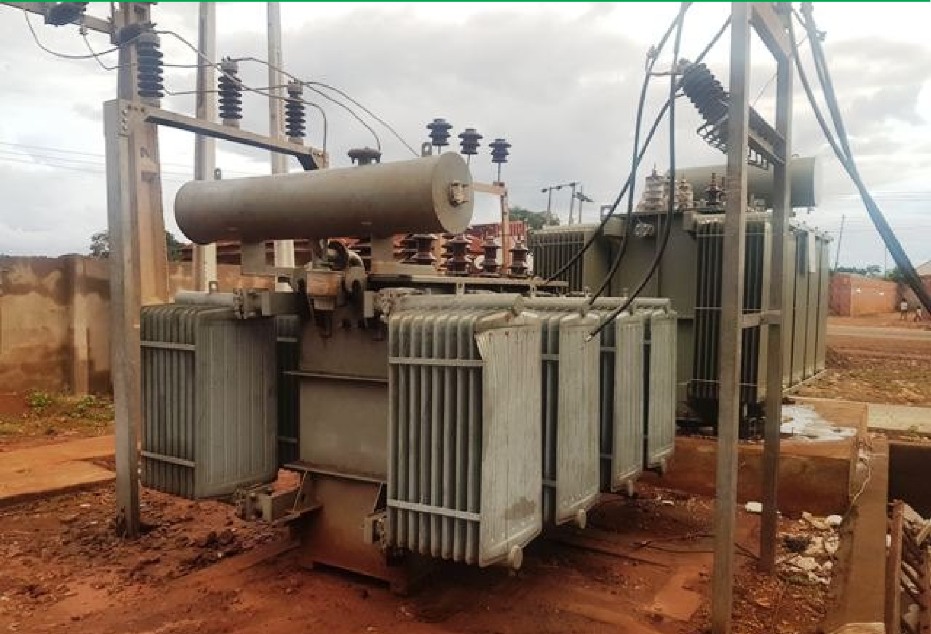
One of the two newly procured step-down transformers to restore power supply to Mokwa town