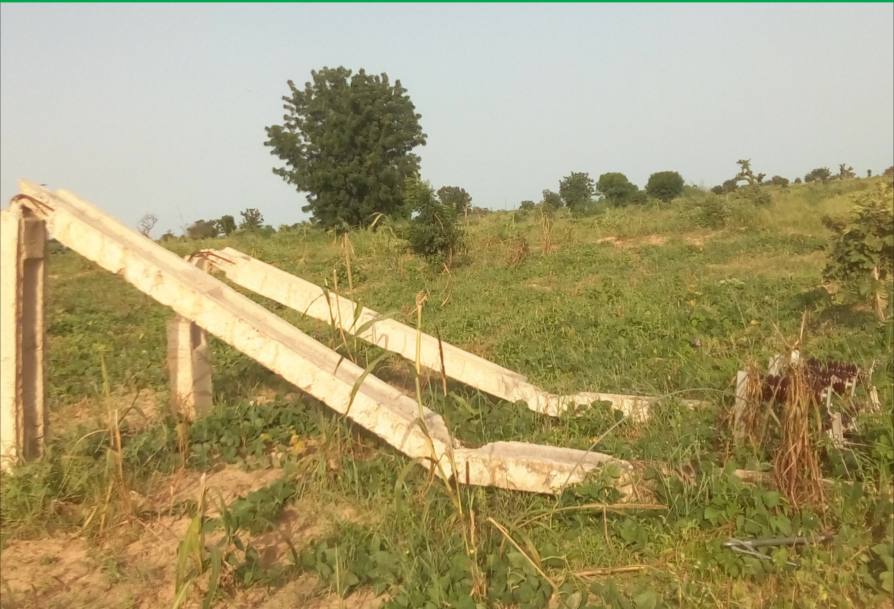
Two of the fallen electric poles in Ungwabawa, near Birnin Kebbi, Kebbi State. The electrification project had been abandoned for nine years.