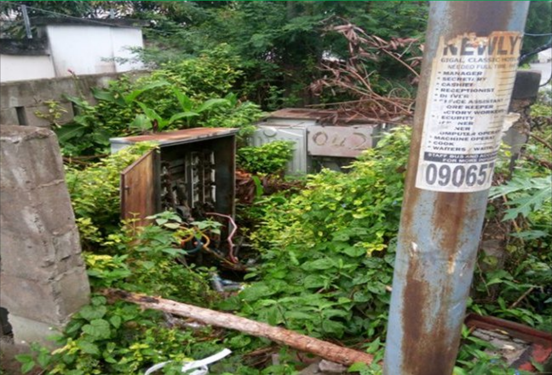
Transformer and feeder pillar at Babatunde Jose junction, Samuel Manuwa Street in Victoria Island overgrown with weeds