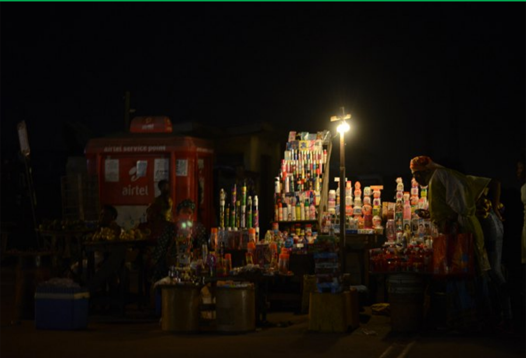
A petty trader relies on a small generator to light up her wares at Pen Cinema, Agege, Lagos.