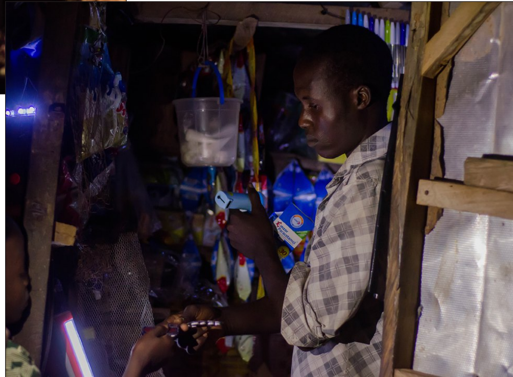
A petty trader along the main route of Igbusi Community lights up his shop at night with torch lights,