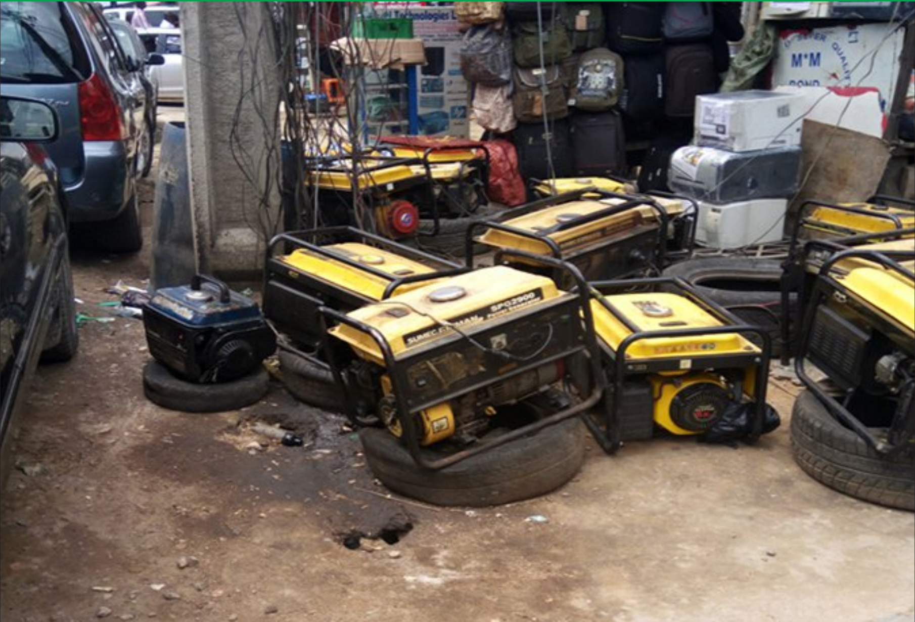
Shop owners use generators to power their shops at Computer Village, Ikeja, Lagos.