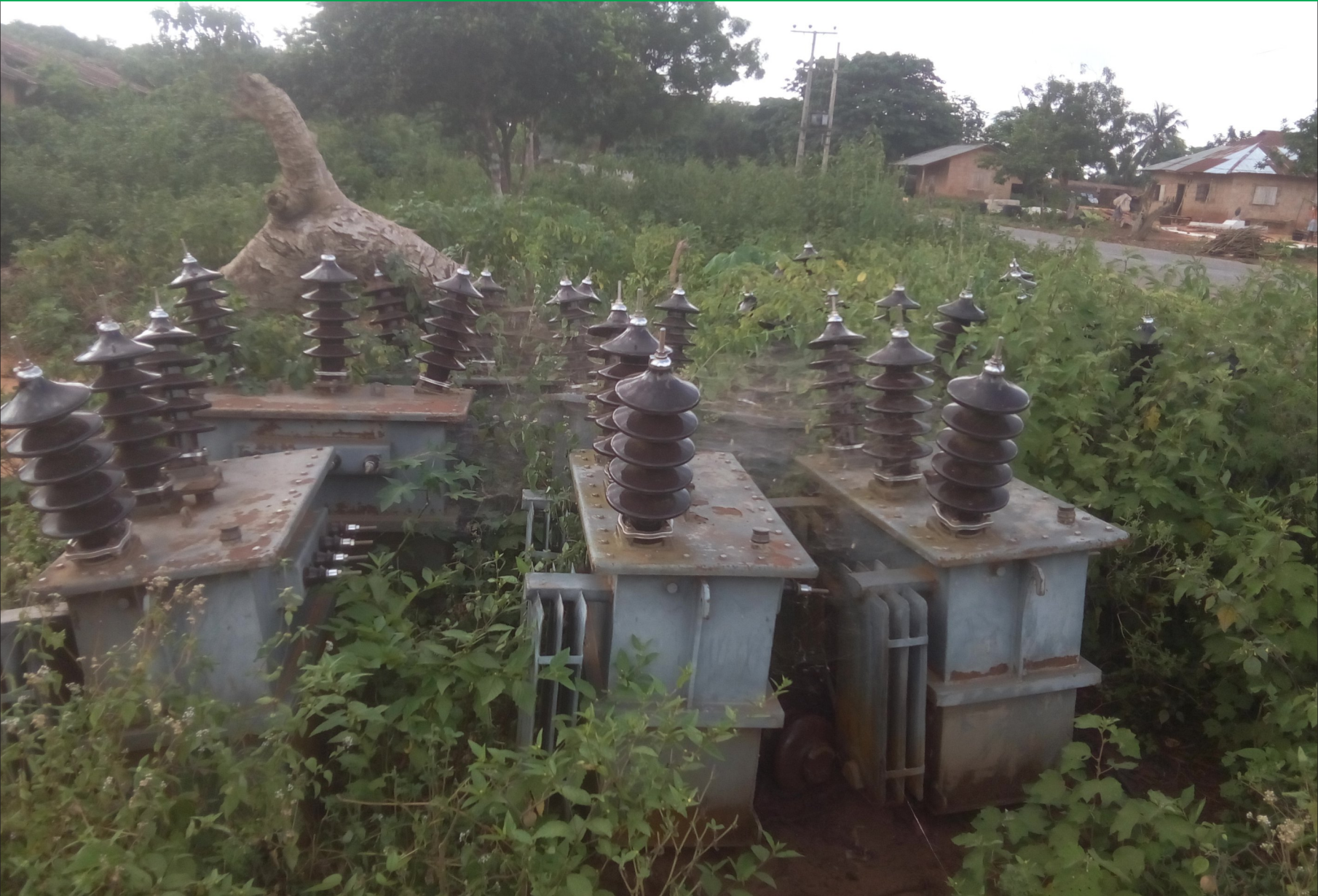
Twenty Six distribution transformers rotting away in Ologiri, near Oja-Odan in Ogun State