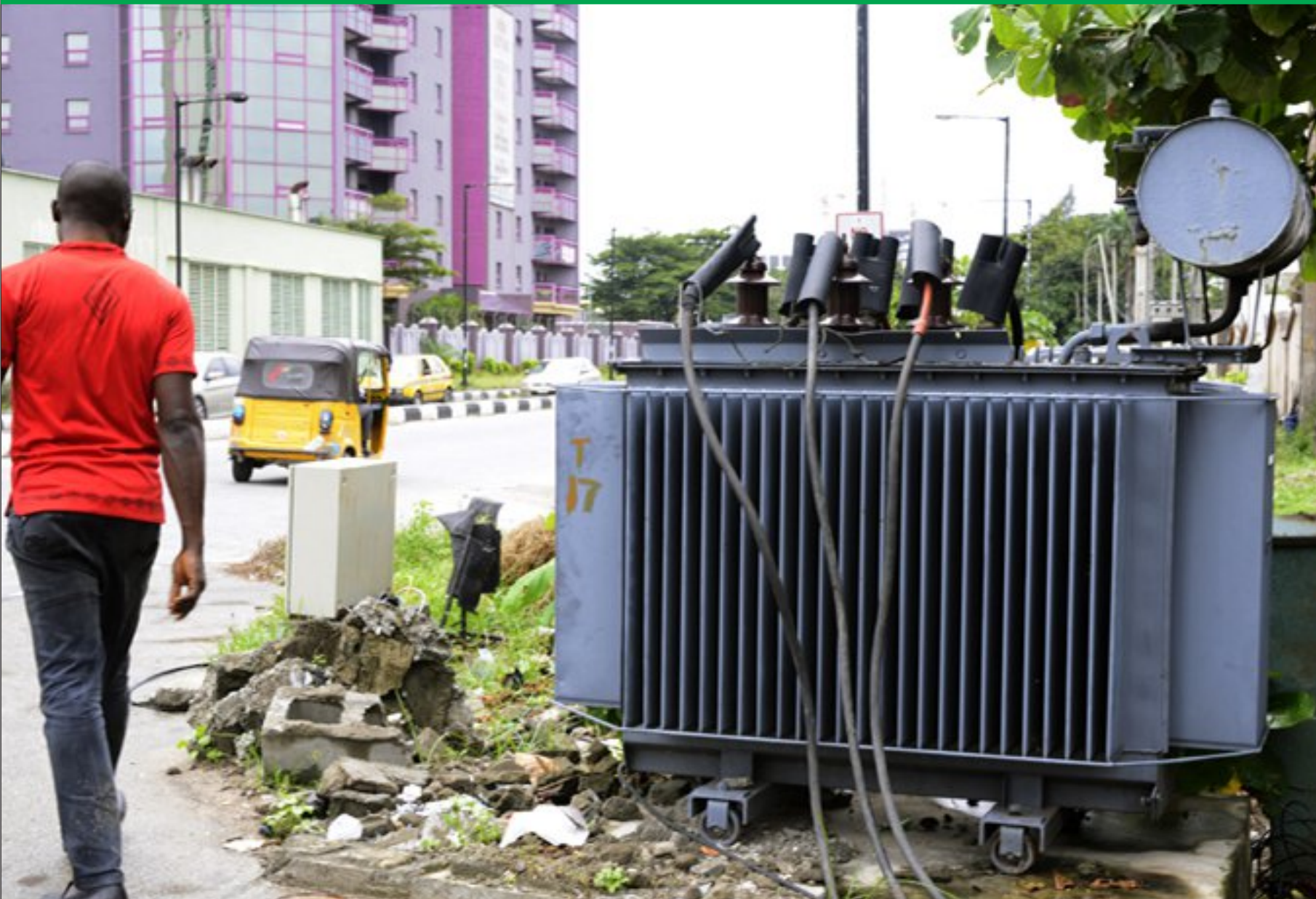
A man walks past unfenced transformer at Bishop Aboyade Cole, Victoria Island, Lagos