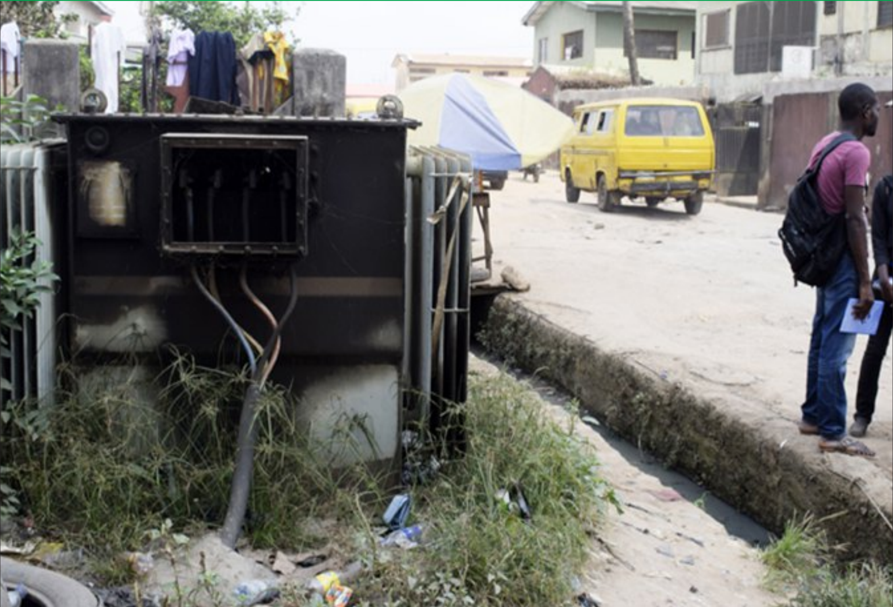
Moribund transformer at Sofunde, Agege, Lagos