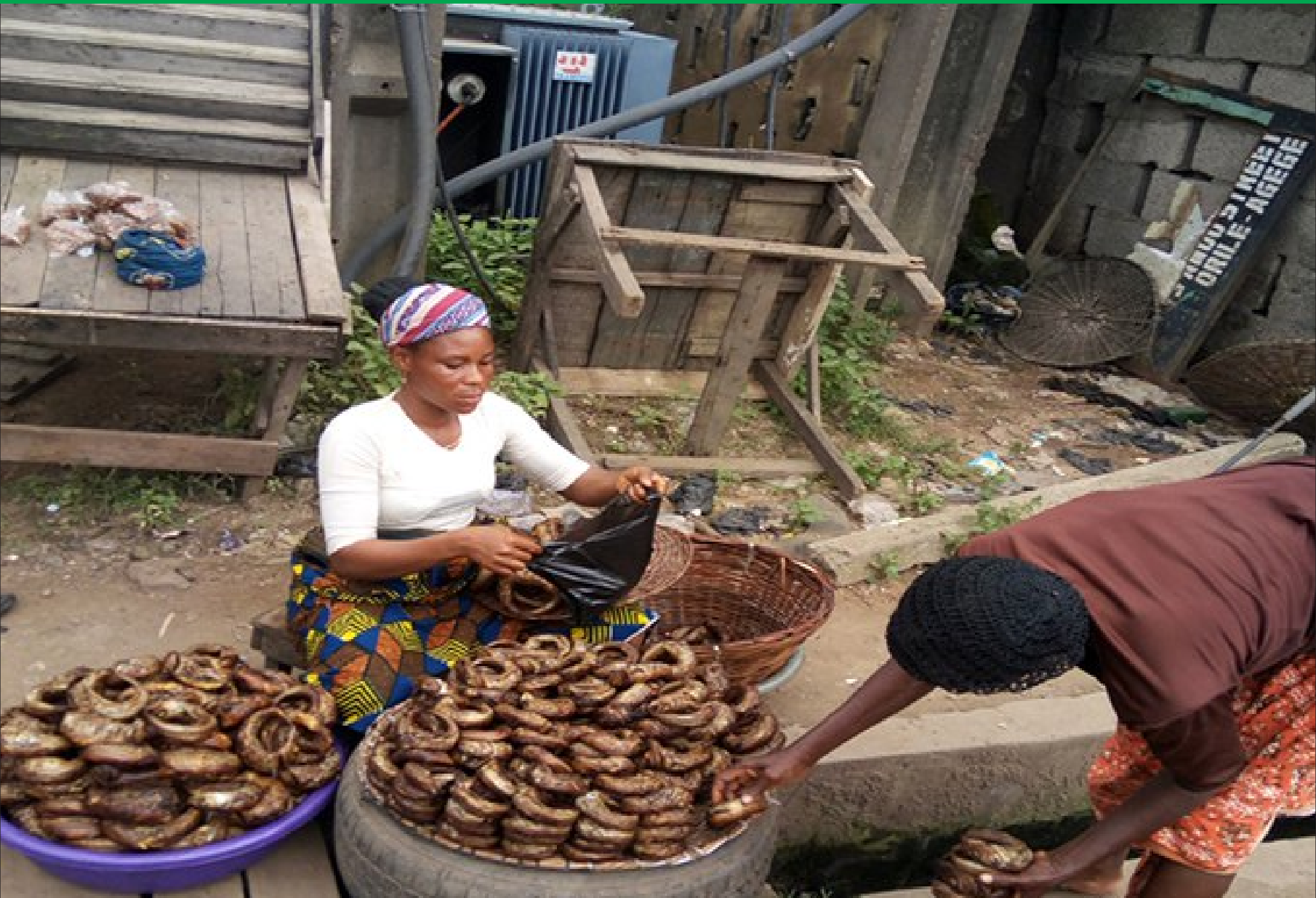
A woman turns an unfenced transformer into a stand for selling fish at Oke-Koto area, Agege, Lagos.