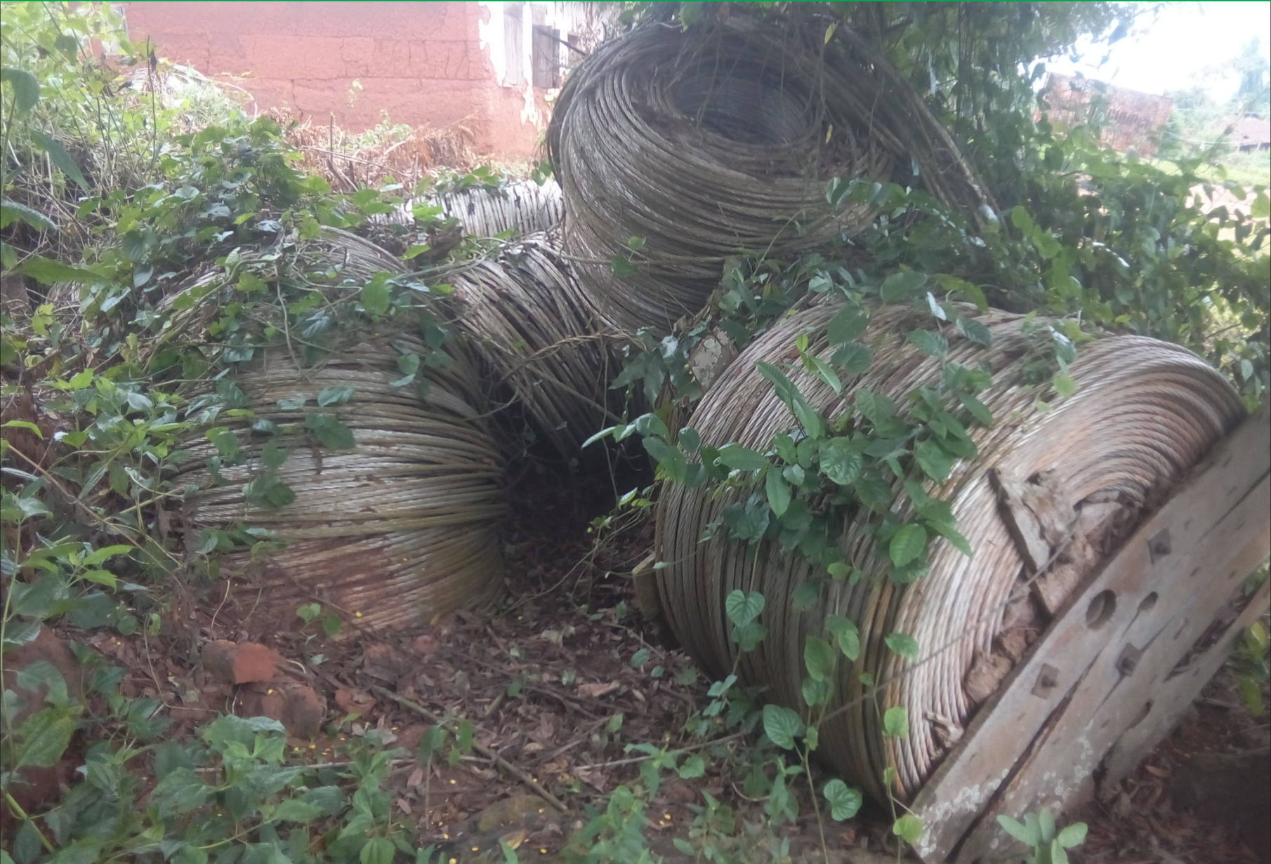
A armoured cables and distribution transformers covered by weeds in Irogun Akere, Yewa South, Ogun State